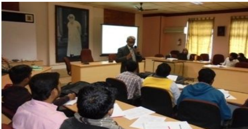
Two-day Orientation Programme for Ph. D Scholars