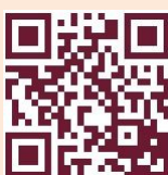
OpenAthens (Remote Access)