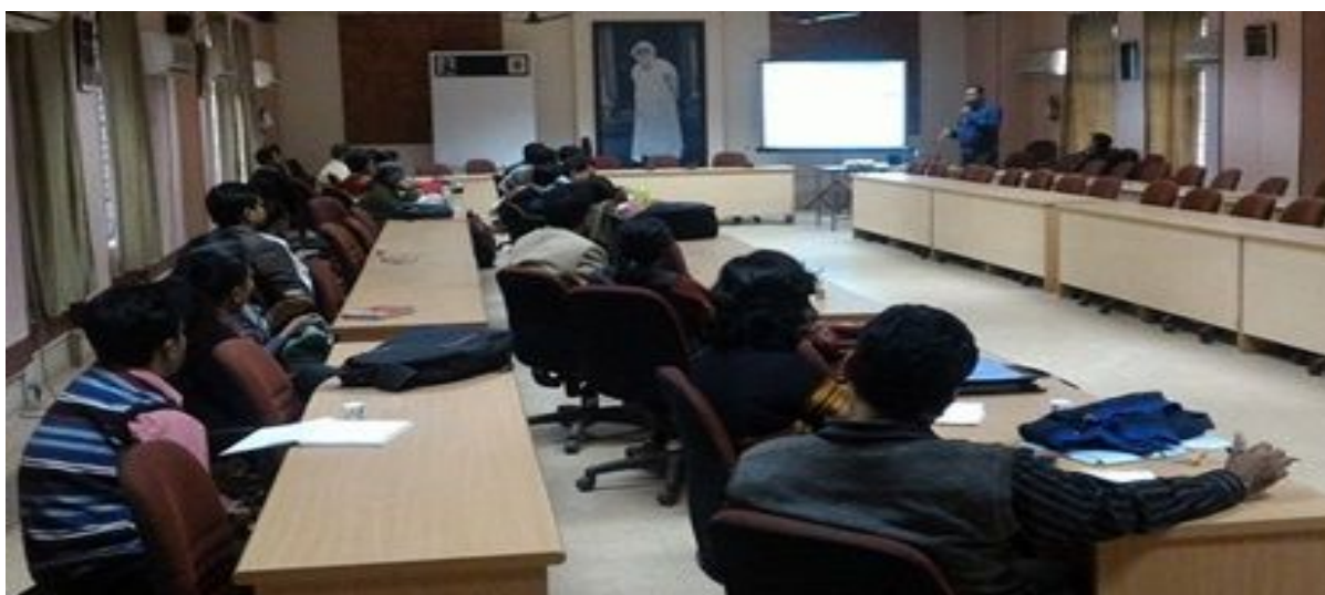
Training programme on OpenAthens (Remote Access) & Discovery Services