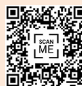
Video on Journal Section