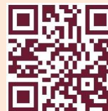
Know Your Library (FAQs)