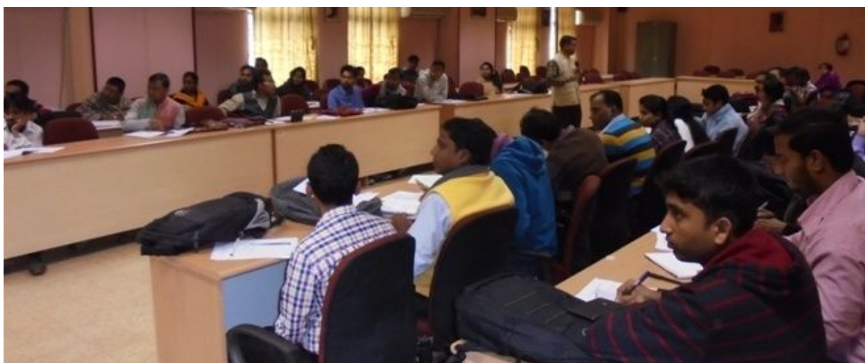
Two-day Orientation Programme for Ph. D Scholars