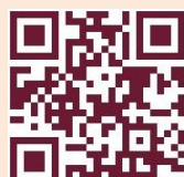
Web of Science