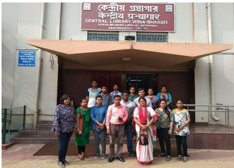
Team from DLIS, University of Calcutta, Kolkata