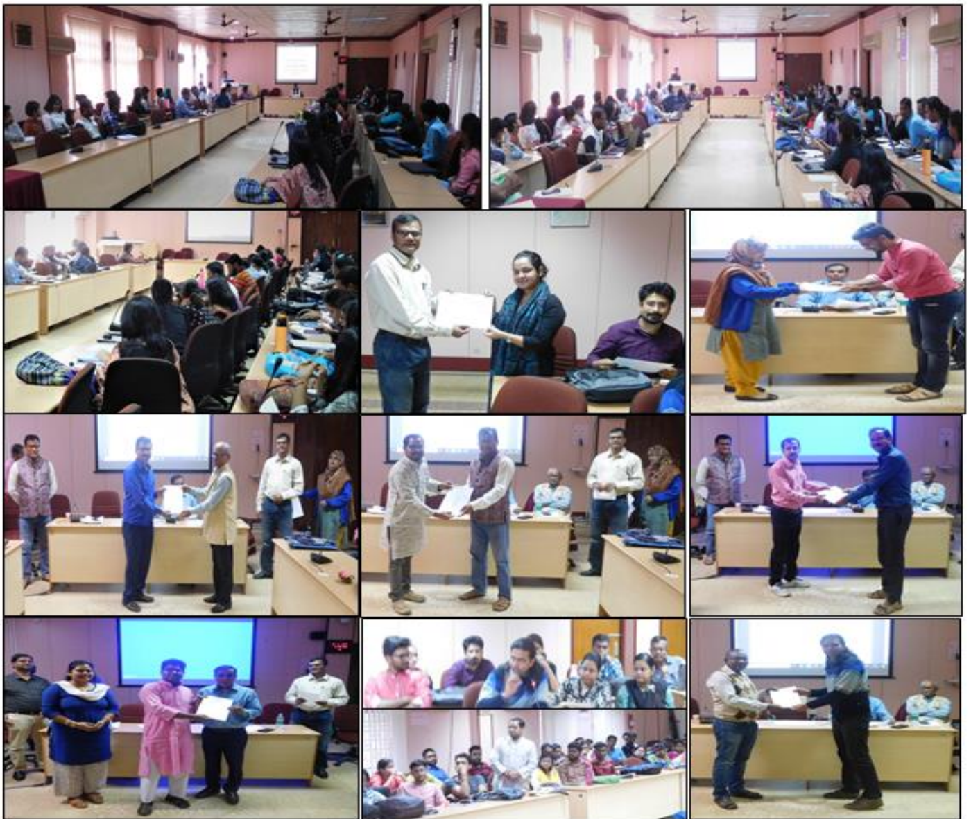
Two-day Workshop on Research Methodology