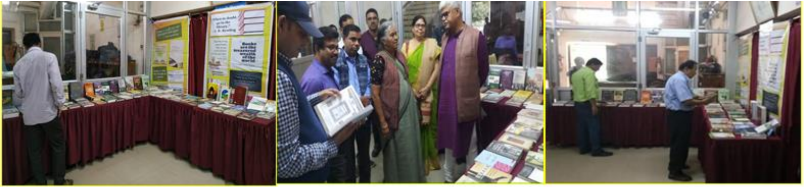
Book Exhibition to Mark Indian Constitution Day 26 Nov – 03 Dec