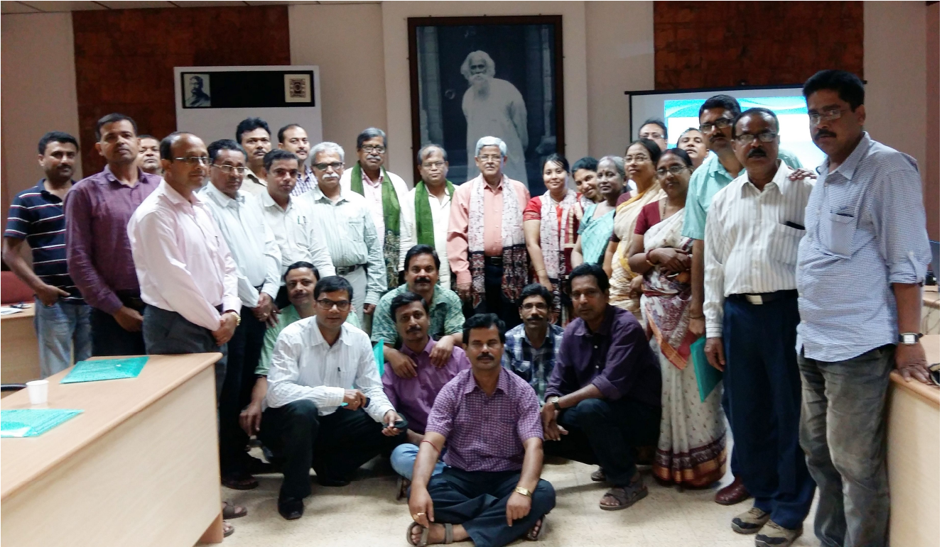
Group Photo at the Valedictory Function of Workshop on Personality Development, 12 Sept.