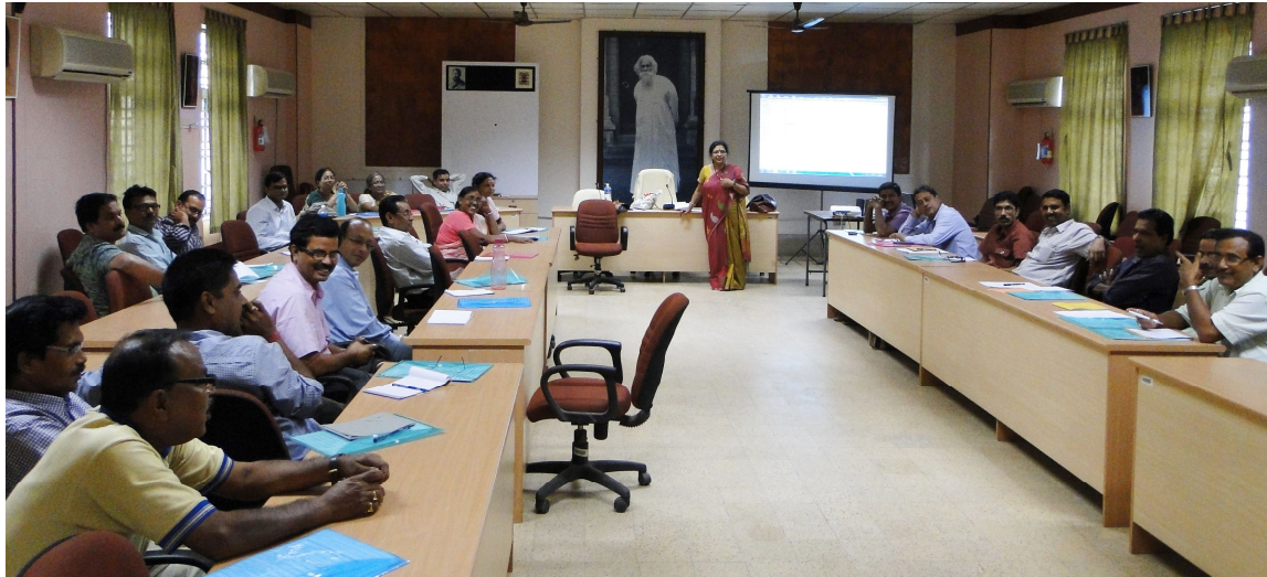
Workshop on Personality Development, 11 Sept