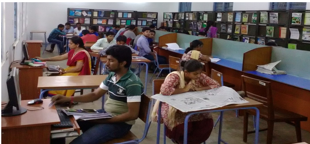
Readers at PSB Library