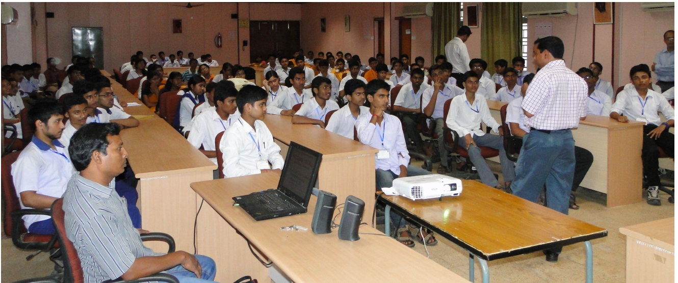
Orientation Programme, DST-INSPIRE: 15 Sept