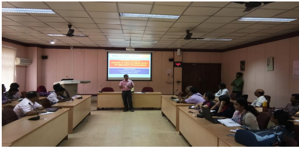
Special Session on URKUND on 26 March.