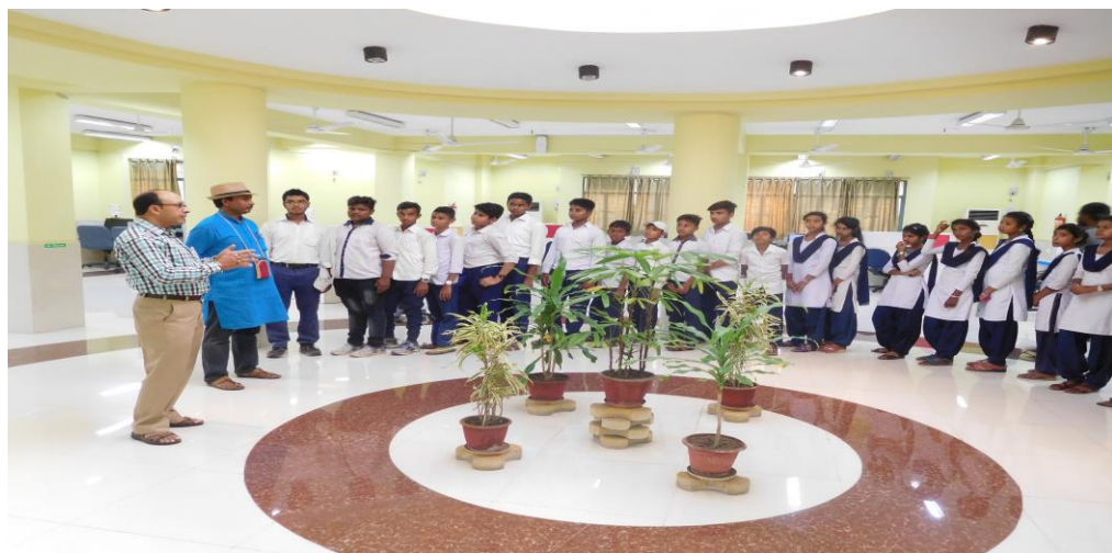
School students are in the Journal Section during their visit on 29 March.