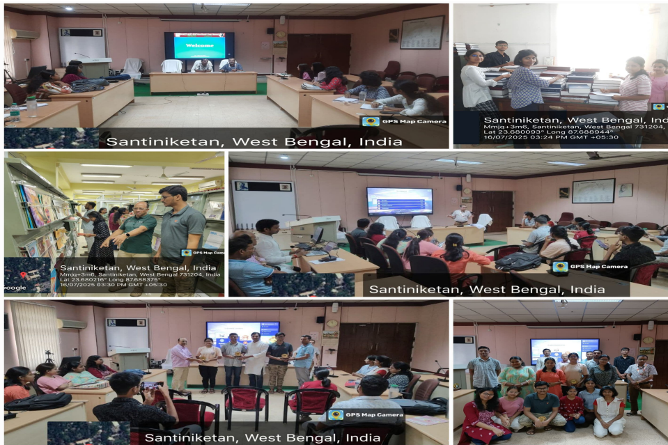
Glimpses of Orientation of the Candidates of Internship Program