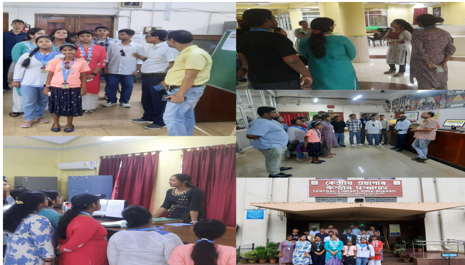
Glimpses of visit of the team from Mount Zion School, Kolkata