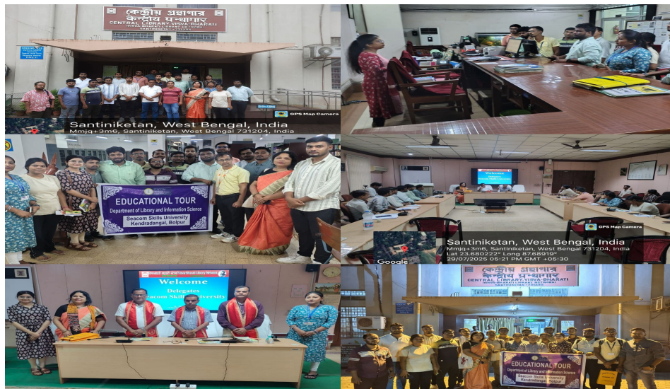
Moments of the visit of the team from Seacom Skill University