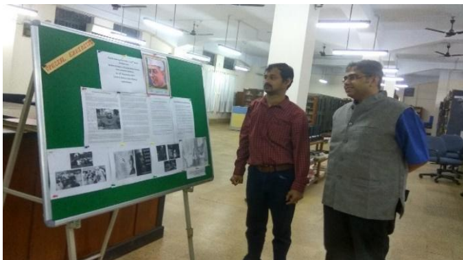
A Tribute to Pandit Jawahar Lal Nehru on his 127 th Birth Anniversary on 14 Nov.