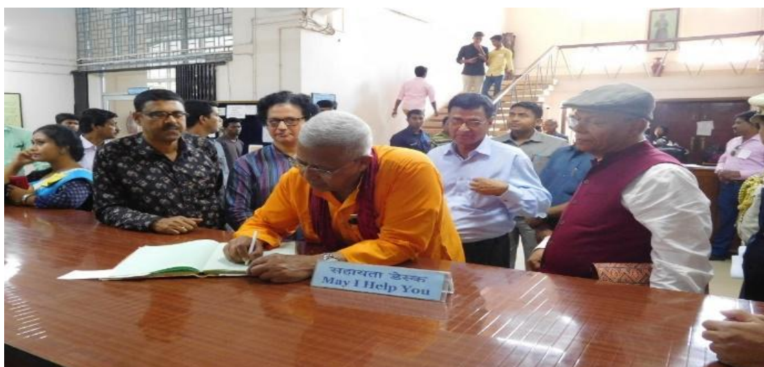
Sri Tathagata Roy, Hon'ble Governor, Tripura Visited Central Library on 13 Nov.