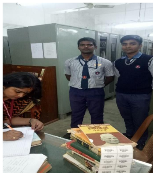
Teacher and students, Techno India Group Public School, Bolpur visited Hindi Bhavana Library on 24 Nov.