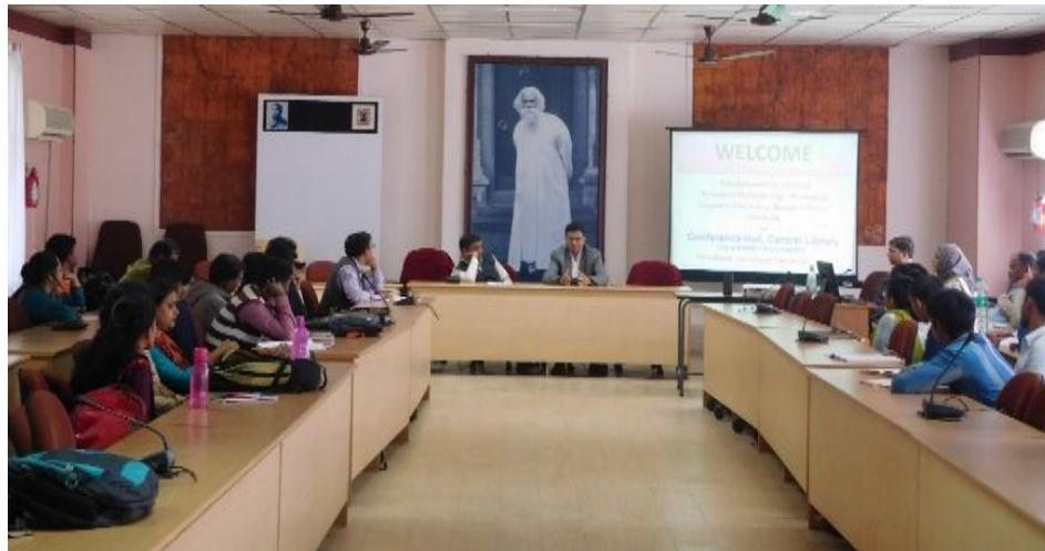
Moment of Inauguration of the two-day Workshop on Research Methodology on 24 Nov.