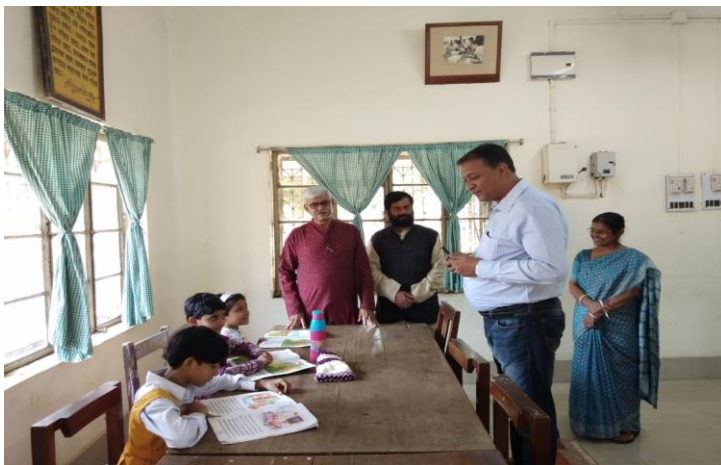
Visit by Hon'ble Upacharya, VB: at Patha Bhavana Library