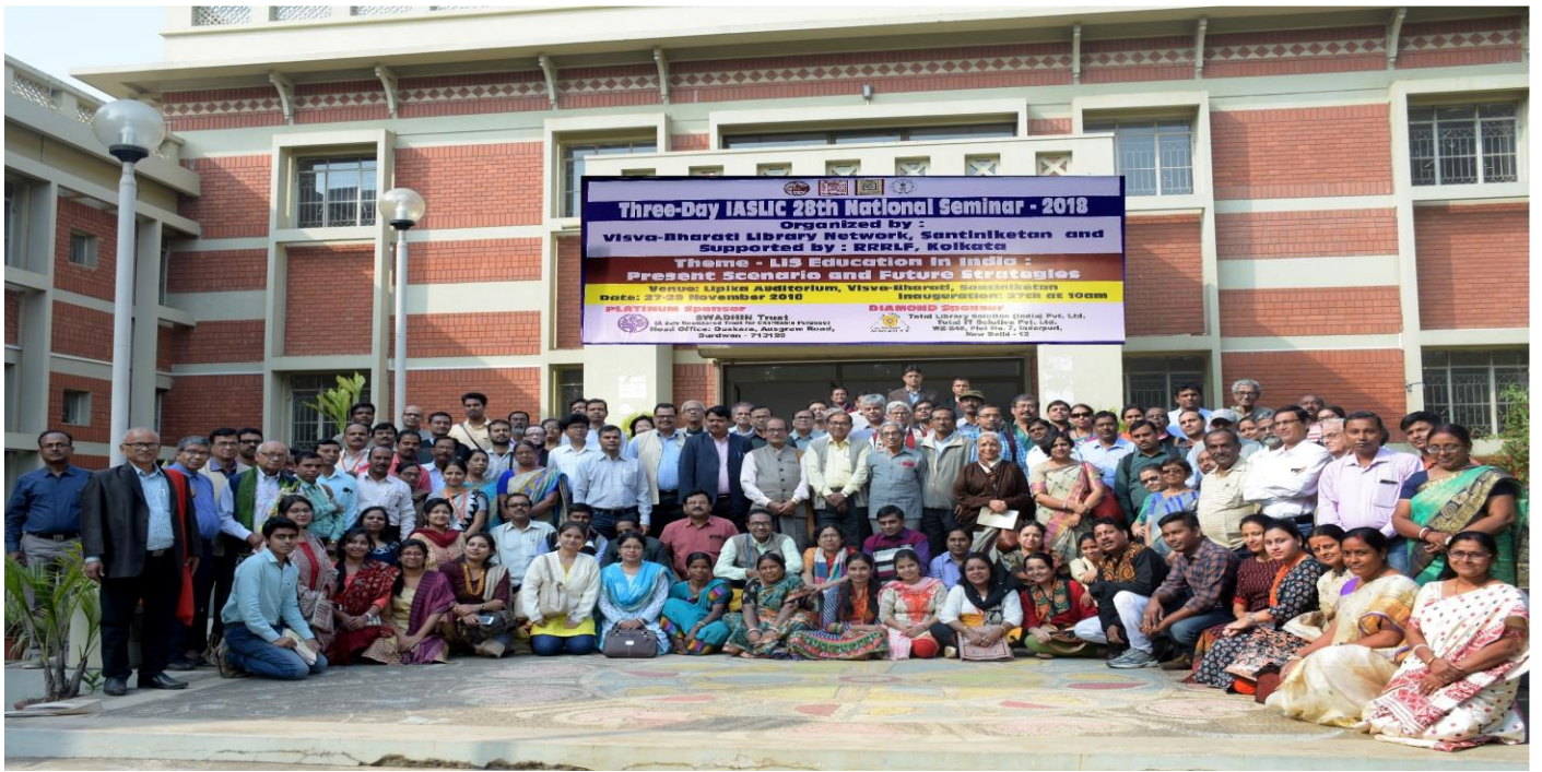
Group Photograph of IASLIC 28 th National Seminar during 27-29 November 2018