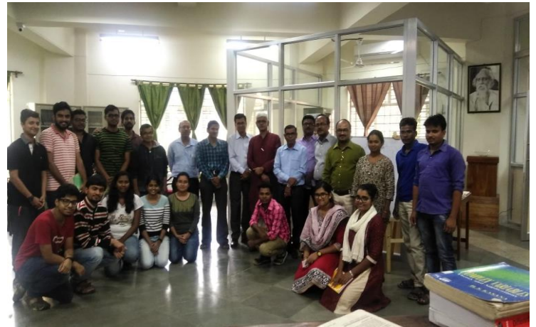
Visit by Hon'ble Upacharya, VB: at Siksha Bhavana Library