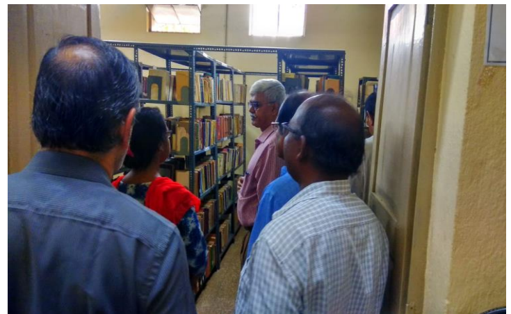
Visit by Hon'ble Upacharya, VB: at Sangit Bhavana Library