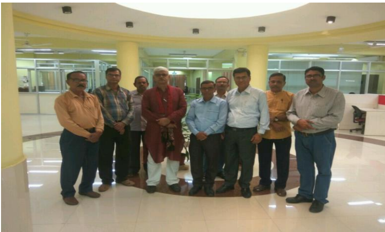
Visit by Hon'ble Upacharya, VB: at Central Library