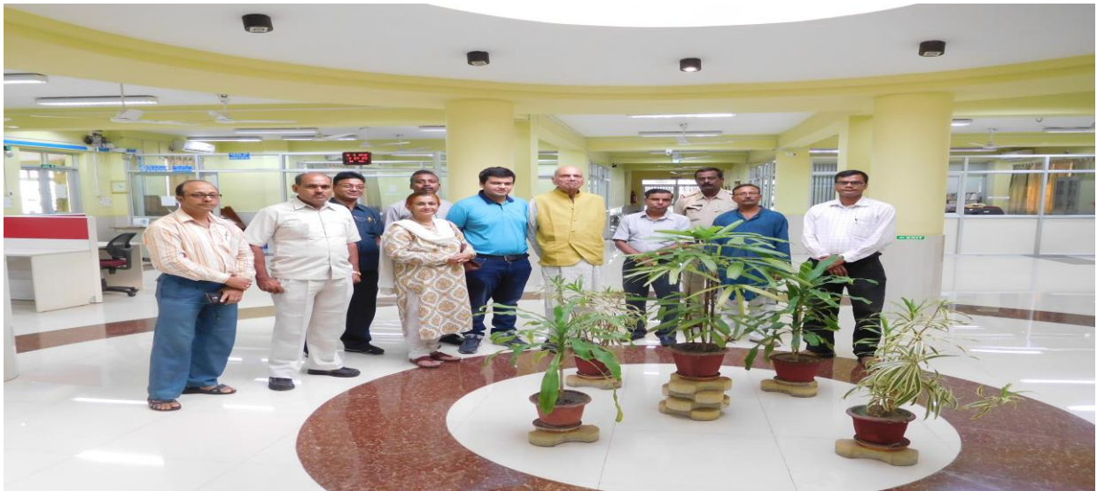
Visit of Haider Aziz Safwi, Hon'ble Deputy Speaker, West Bengal State Legislative Assemble at Central Library on 18 June