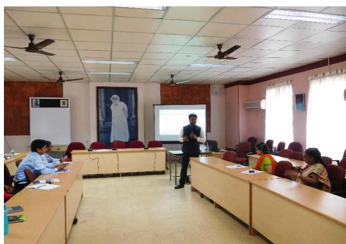
Special Session on 29 May by OUP at 11.30am and by Informatics at 12.30pm