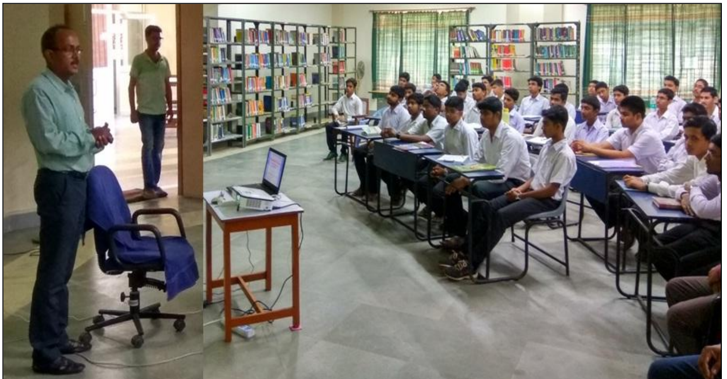
Library Orientation Programme at Siksha-Bhavana Library