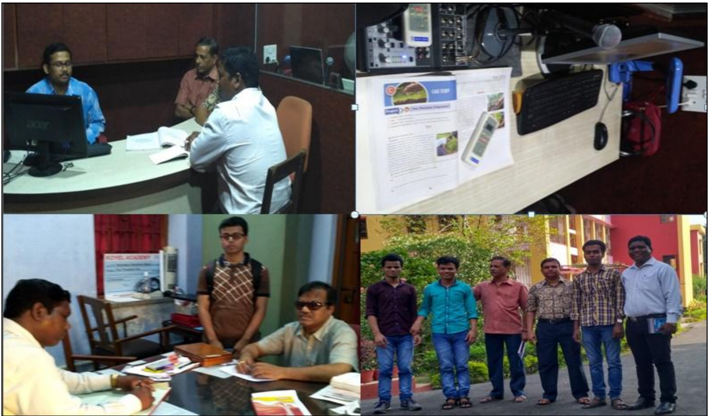
Visit of Ramakrishna Mission Blind Boys' Academy, Narendrapur