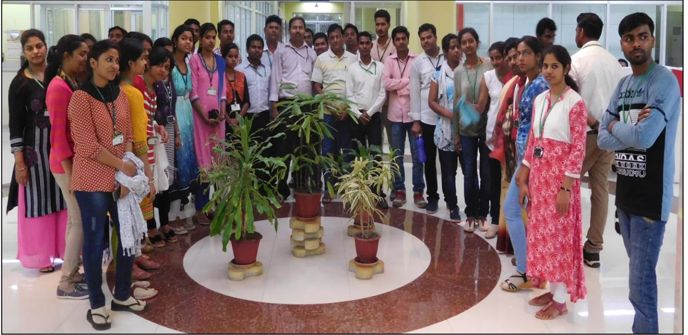
Library visit of the faculty and students of Education, Central University of Jharkhand