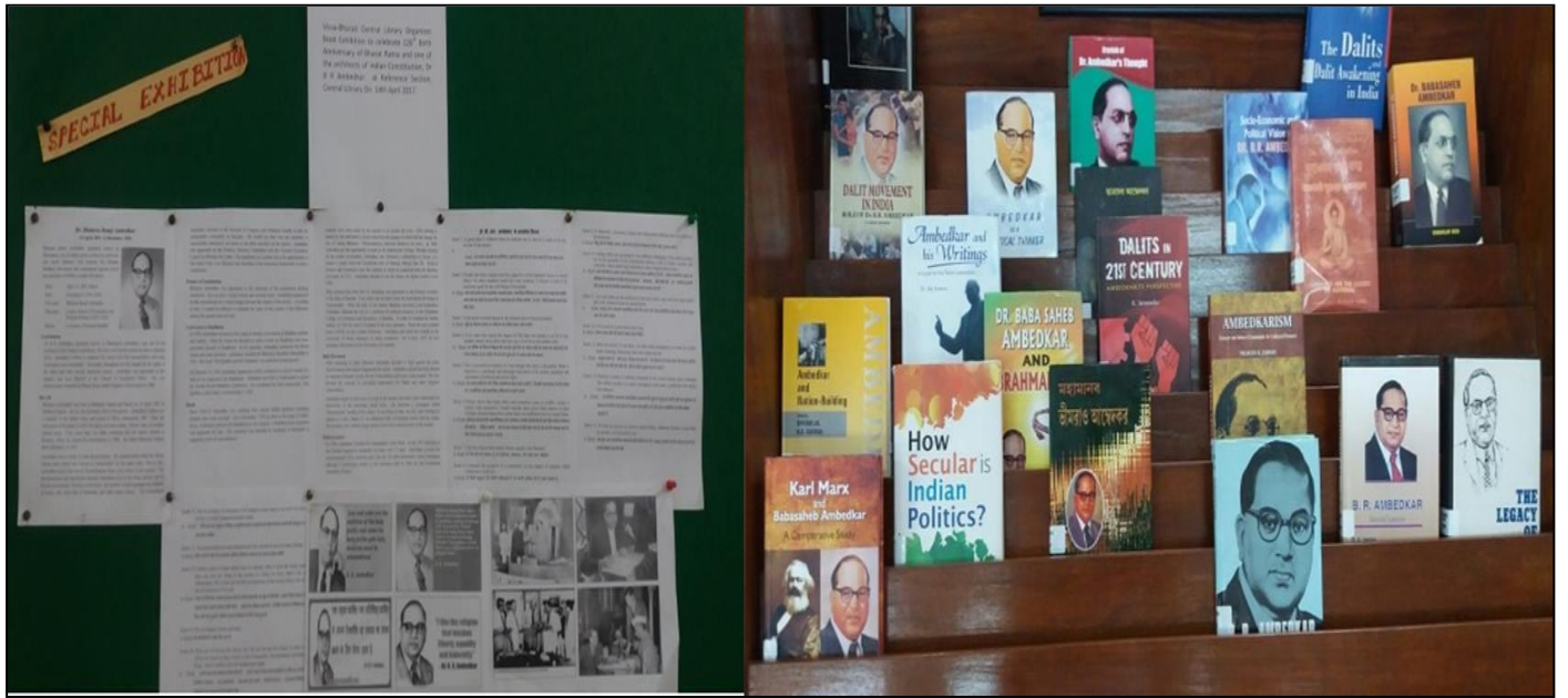
Special Exhibition: 126 th Birth anniversary of Dr. B. R. Ambedkar