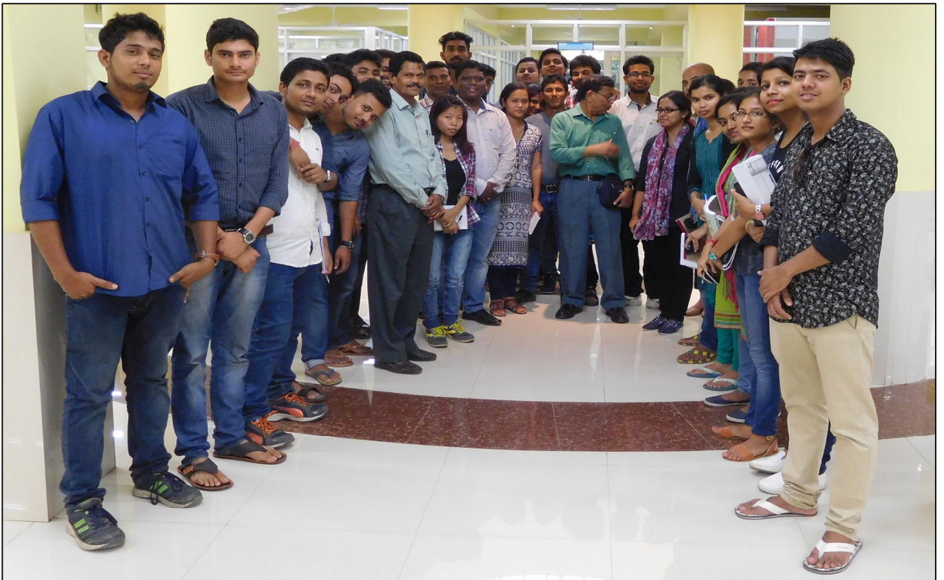
Students from Guwahati University in the Inter-active Session in Central Library