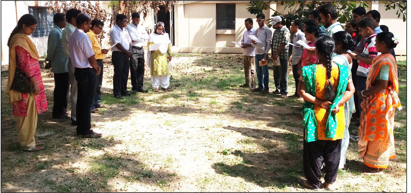
Pledge taking on 'Vigilance Awareness Week, 2016' at Quadrangle, Central Library