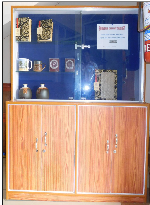
Souvenir Shop – Display Cabinet at the Entrance to Central Library