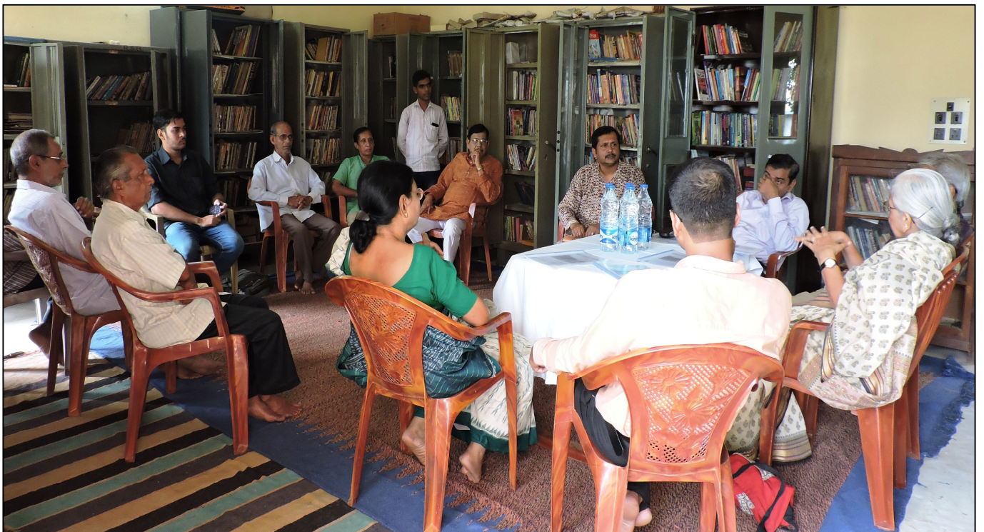
Discussion by Officers from Central Library at Raipur Public Library, Bolpur