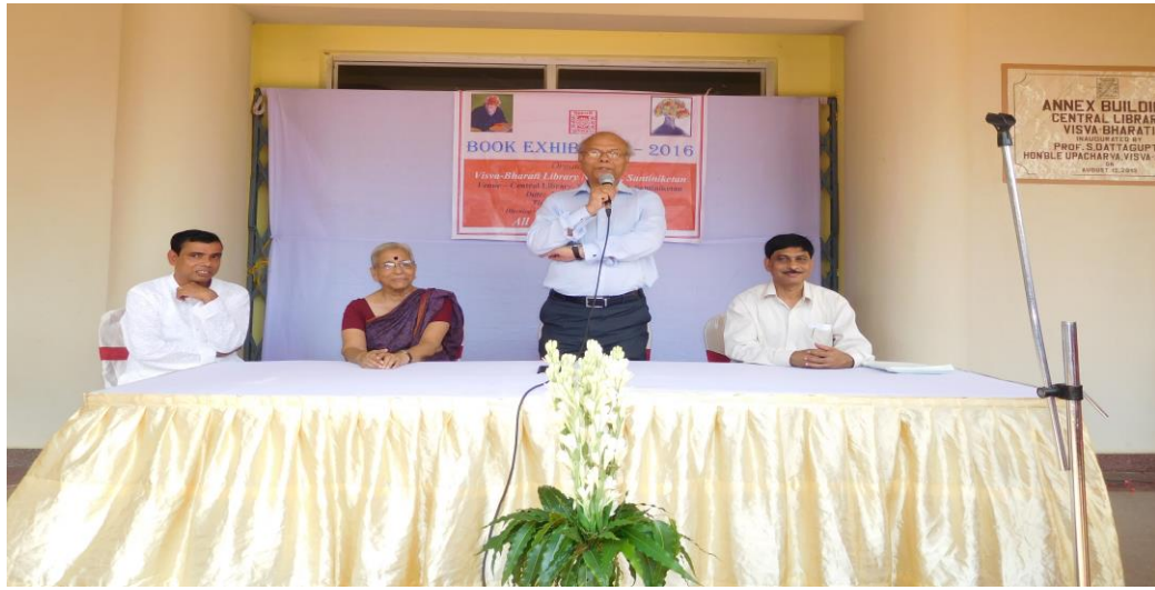
Speech by the Hon'ble Vice Chancellor (Offg.), in the inaugural session of the 'Book Exhibition-2016'