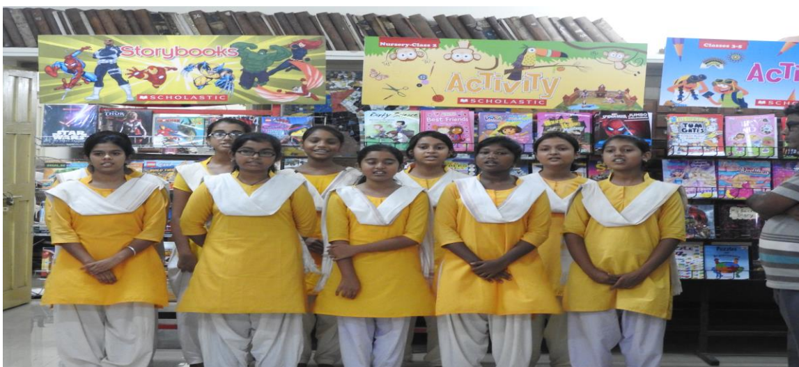
Book Fair at Patha Bhavana Library organized by Scholastic during 25-27 September 2016