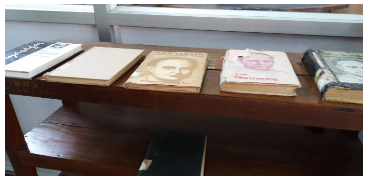
Special Exhibition: on Bhagat Singh on 28/09/2016 and on Ishwar Chandra Vidyasagar on 26/09/2016