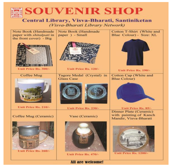
The 'Souvenir Shop' at Central Library inaugurated on 26.09.2016.