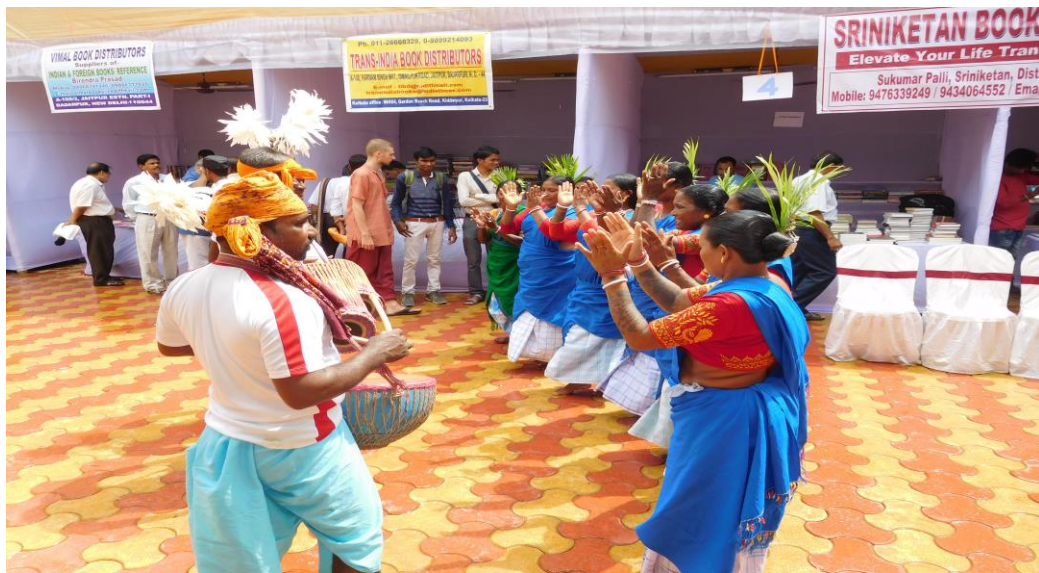
Colour & Merriment added to the Exhibition: Mahadal Staff from the Library Network