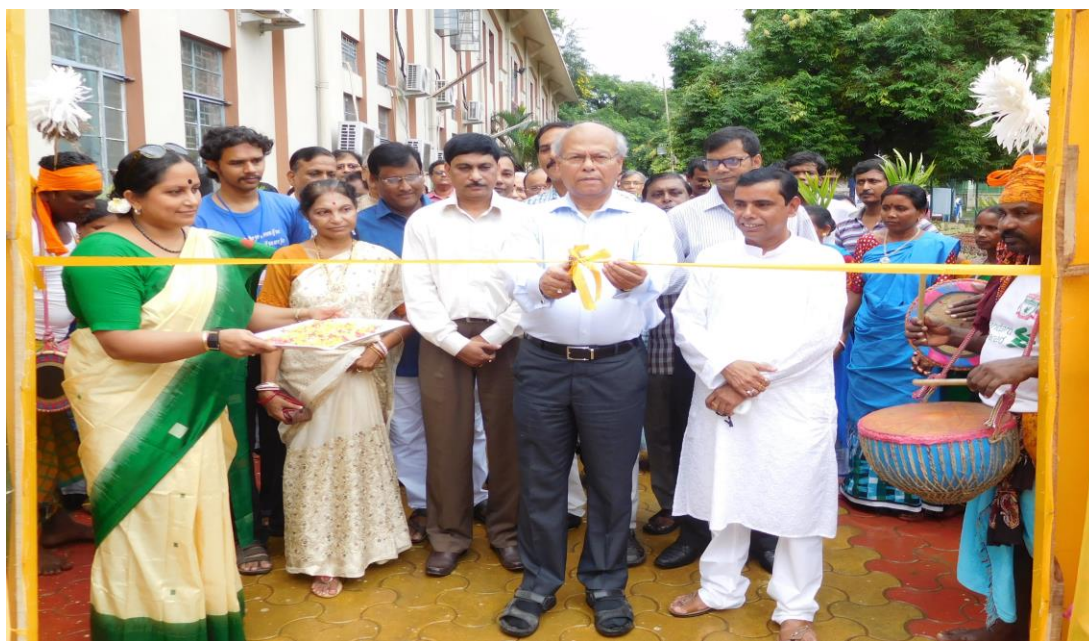
Inauguration of the Book Exhibition -2016 by Hon'ble Vice-Chancellor (Offg.) at Central Library Premises on 26.09.16.