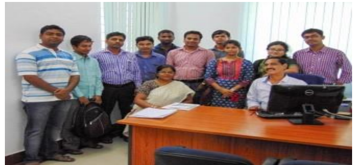
Research Scholars, Students and one Faculty Member of Calcutta University have visited Central Library on 15 Sept. and P.S.B. Library on 16 Sept. 2016