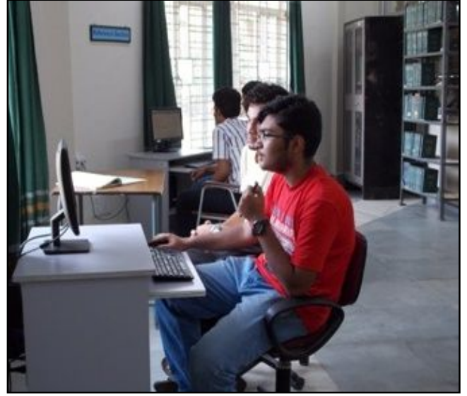
Resource Access at Siksha Bhavana