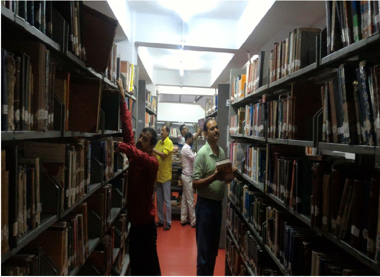
Peak Season at Central Library: Staff lends hands in stacking Books Library