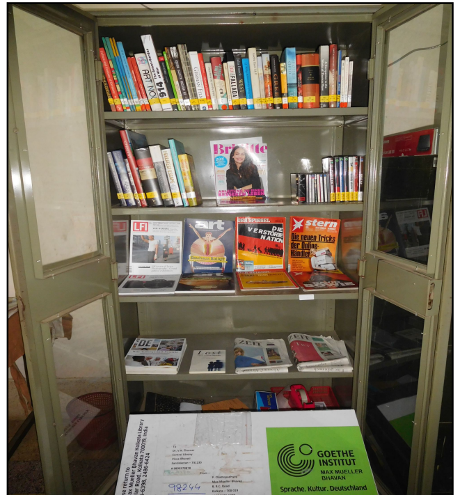
Max Mueller Bhavan Travelling Library at