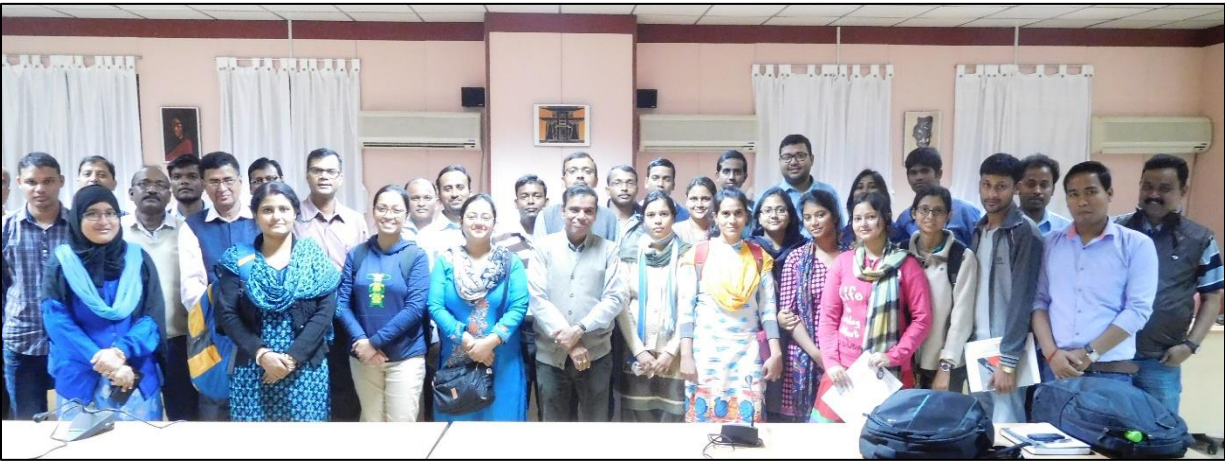
Workshop on Research Methodology