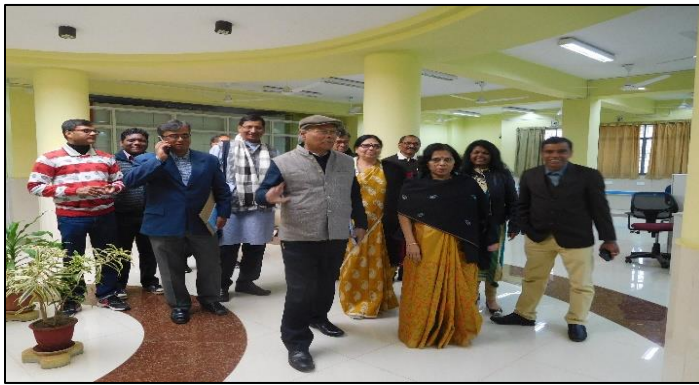
Visit of UGC Inspection Committee