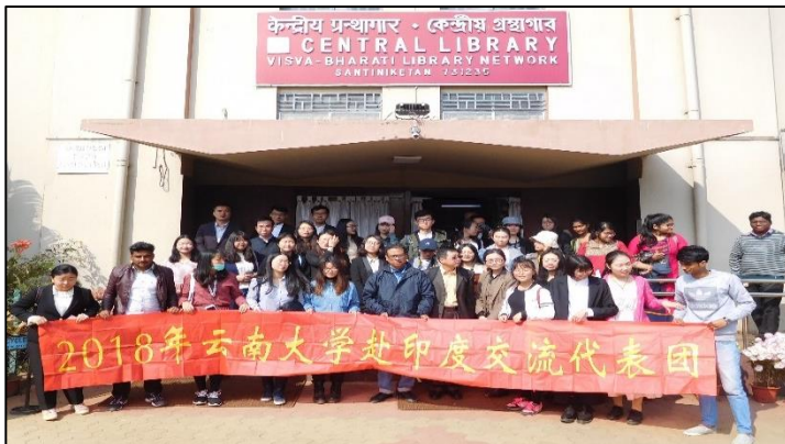
Visit of team from Yunnan University