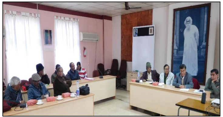
Initial Meeting with IASLIC Executives