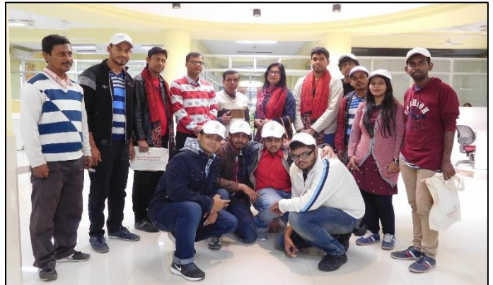
Visit of team from East West University, Dhaka