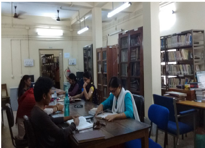
Sangit Bhavana Library: A Partial View

Number of books purchased: 45 (Acc. Nos. HB35521 - 35565)