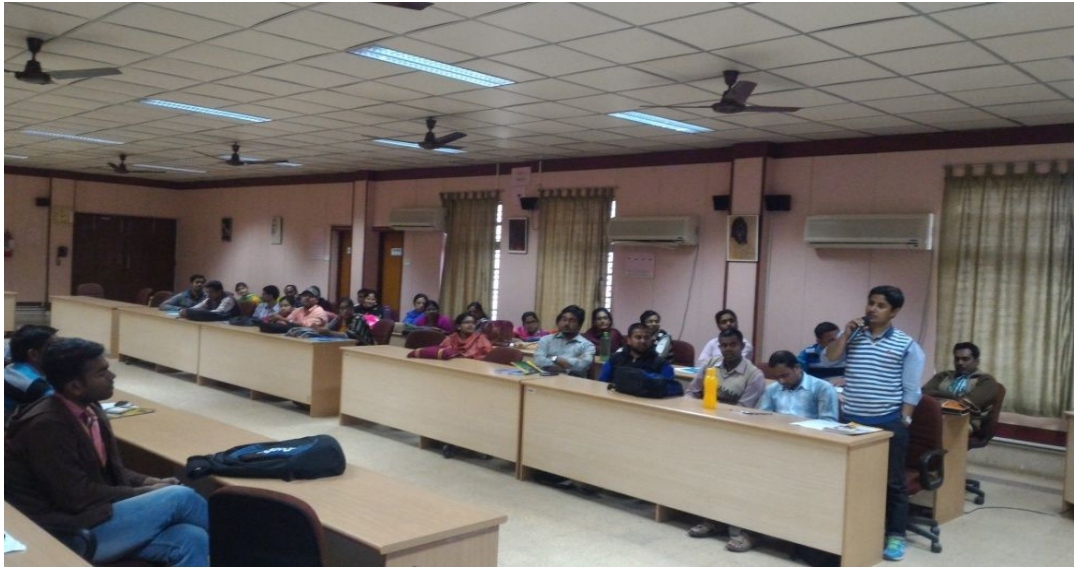
Orientation Programme for Ph. D Scholars: Participants interact