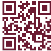
Online Databases (JSTOR, Indiatat, EPW, ISID, Artstor, JGate, ACS, IOP, Nature, CUP, AIP....)