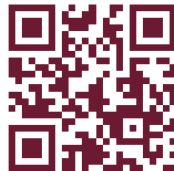
List of Bound Volume Journals