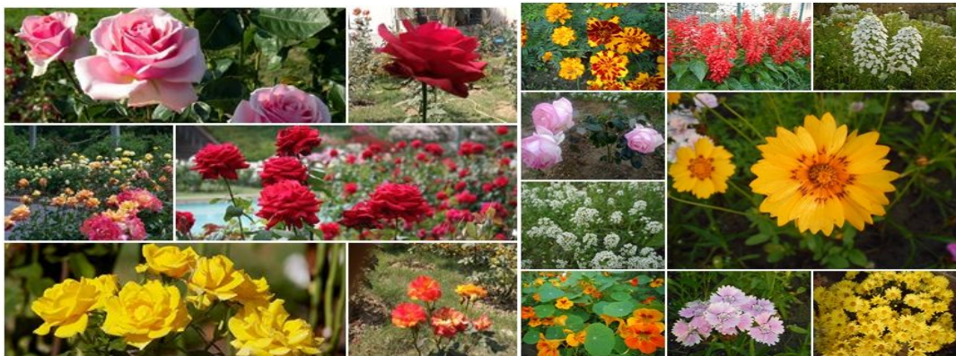
Central Library Gardens: The Flowery Season