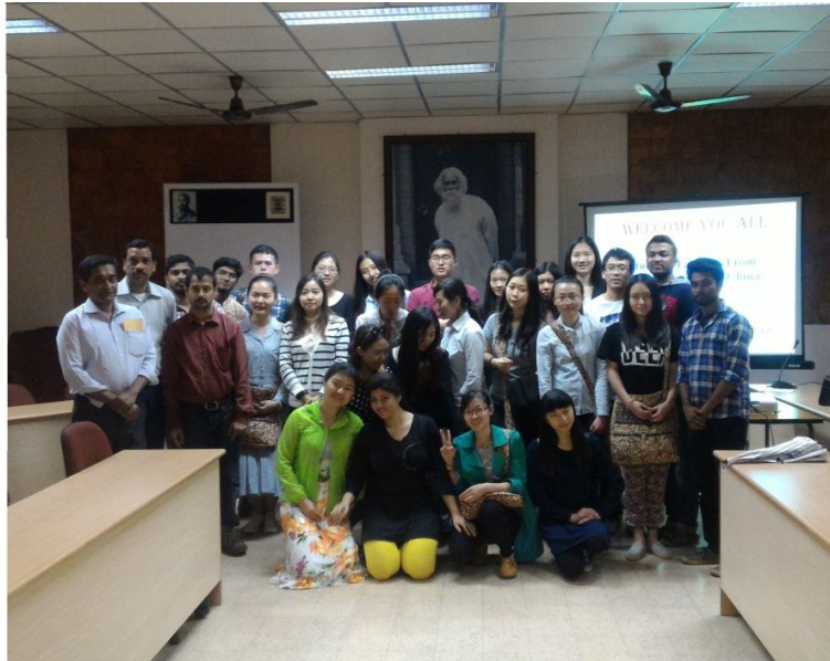
Faculty and Students from Yunnan University, China visit Central Library