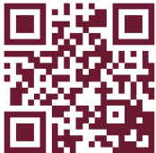
Resources and Services (With Links)