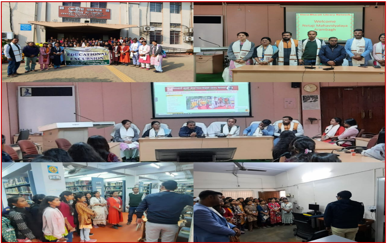
Glimpses of Visit of the students and faculty members of the Netaji Mahavidyalaya, Arambagh