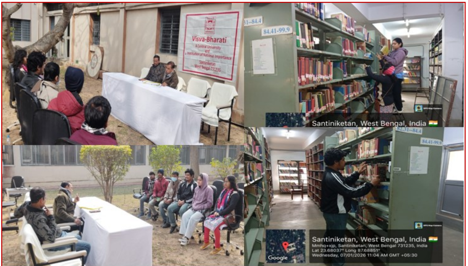
Students of NSOU are in the Collaborative Skill Enhancement Program (CSEP)