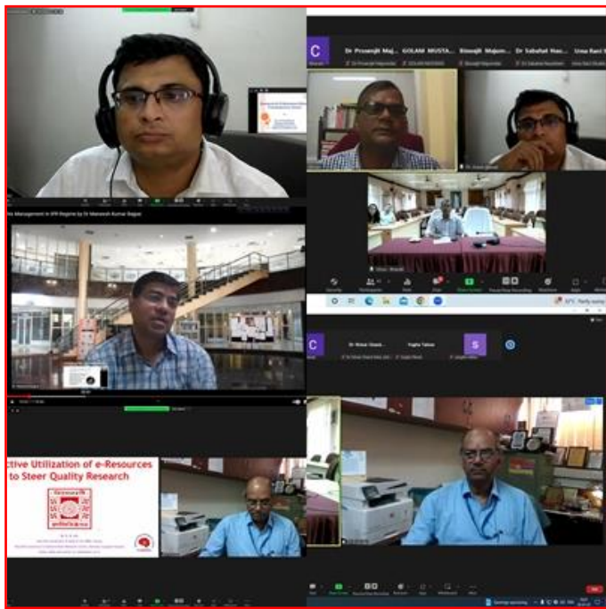
Glimpses of Three-day National Webinar