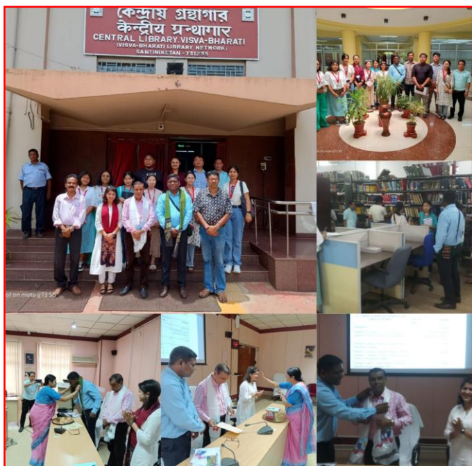
Glimpses of Visit: Team from Sikkim University