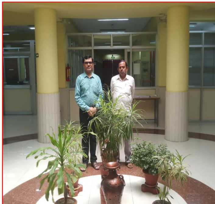
Librarian, BCKV during his visit