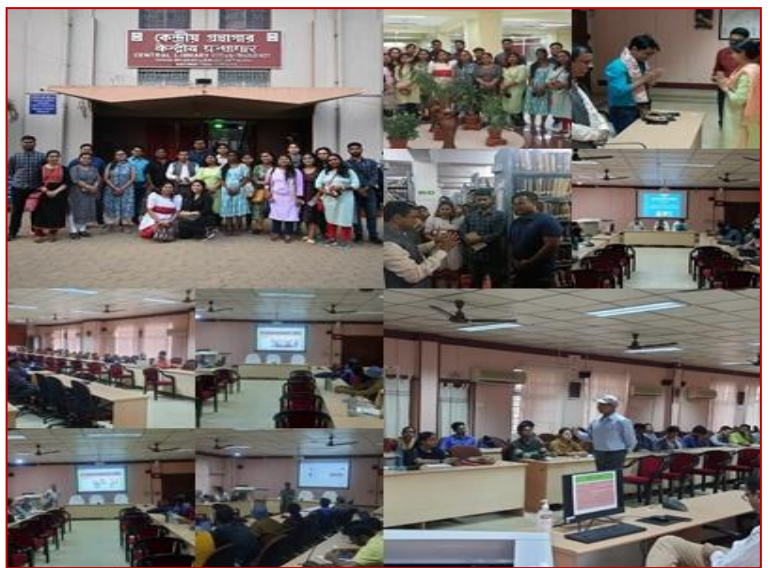
Glimpses of Orientation Program, CMELLCS (09 Feb.) and Special Sessions during 20-22 Feb. and visit by DLIS, RBU on 23 Feb.