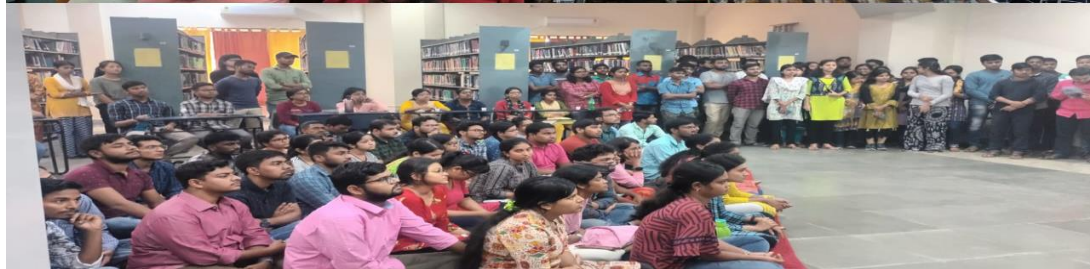
Library Orientation Programme at Siksha-Bhavana Library