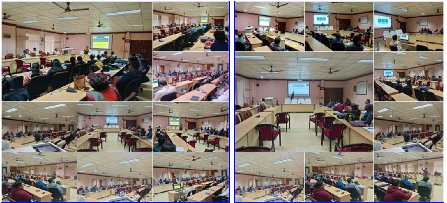
Day-I of the special session (29 November)