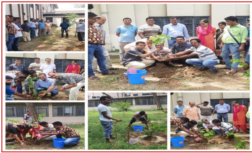
World Environment Day: Tree Plantation at the Central Library Premises