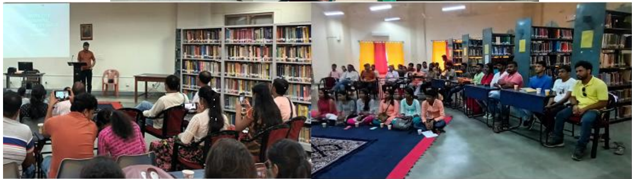
Team from DLISc, The University of Kalyani has visited the Central Library and Siksha Bhavana Library