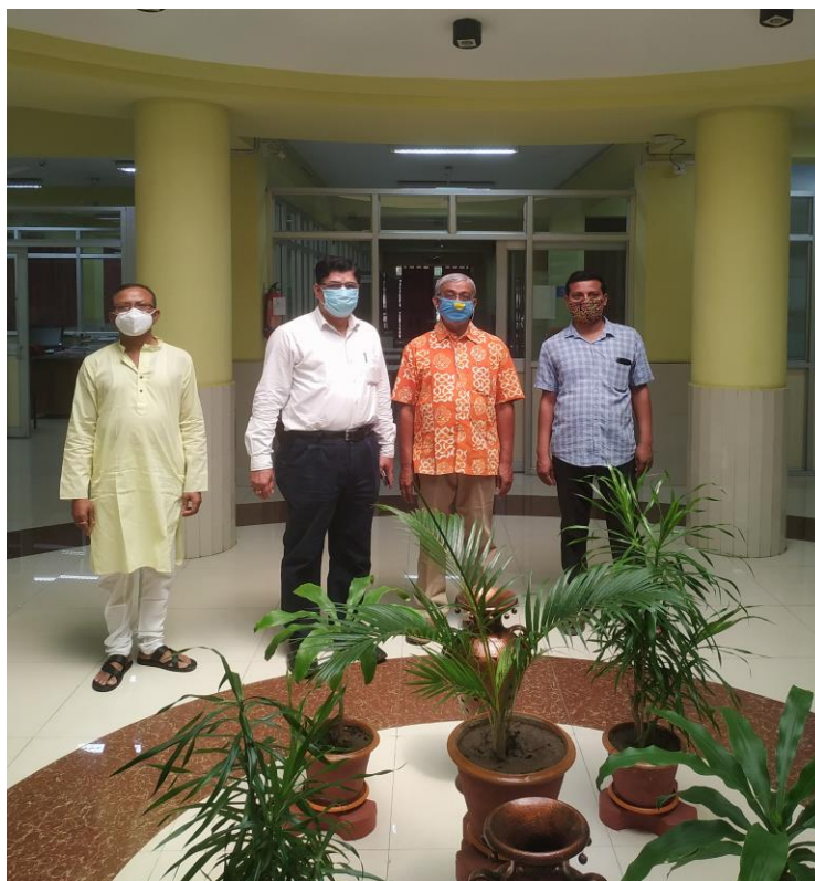
Finance Officer, Tezpur University was at Central Library, VB on 16 April 2021

The National Council for Teacher Education is a statutory body set up under the National Council for Teacher Education Act, 1993 to facilitate planned and coordinated development of the teacher education system in the country, and for regulation and proper maintenance of norms and standards in the teacher education system. The mandate given to the NCTE is very broad and covers the whole gamut of teacher education programs including research and training of persons to equip them to teach at pre-primary, primary, secondary and senior secondary