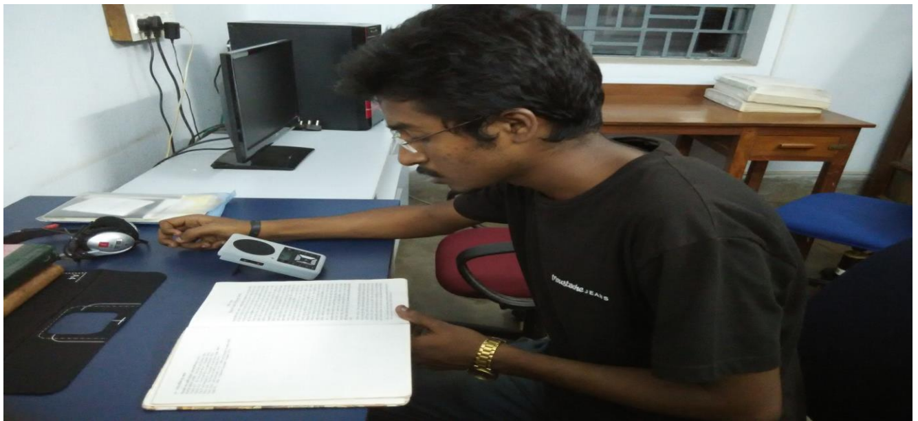
Audio Recording of syllabus-based Books for the Braille Units- A Voluntary Gesture