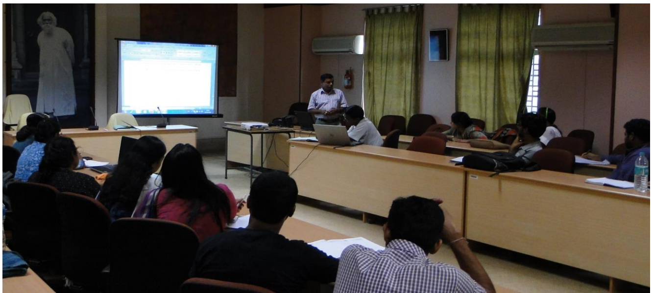
Class on Management of Citing and Referencing during 9-10 October 2015