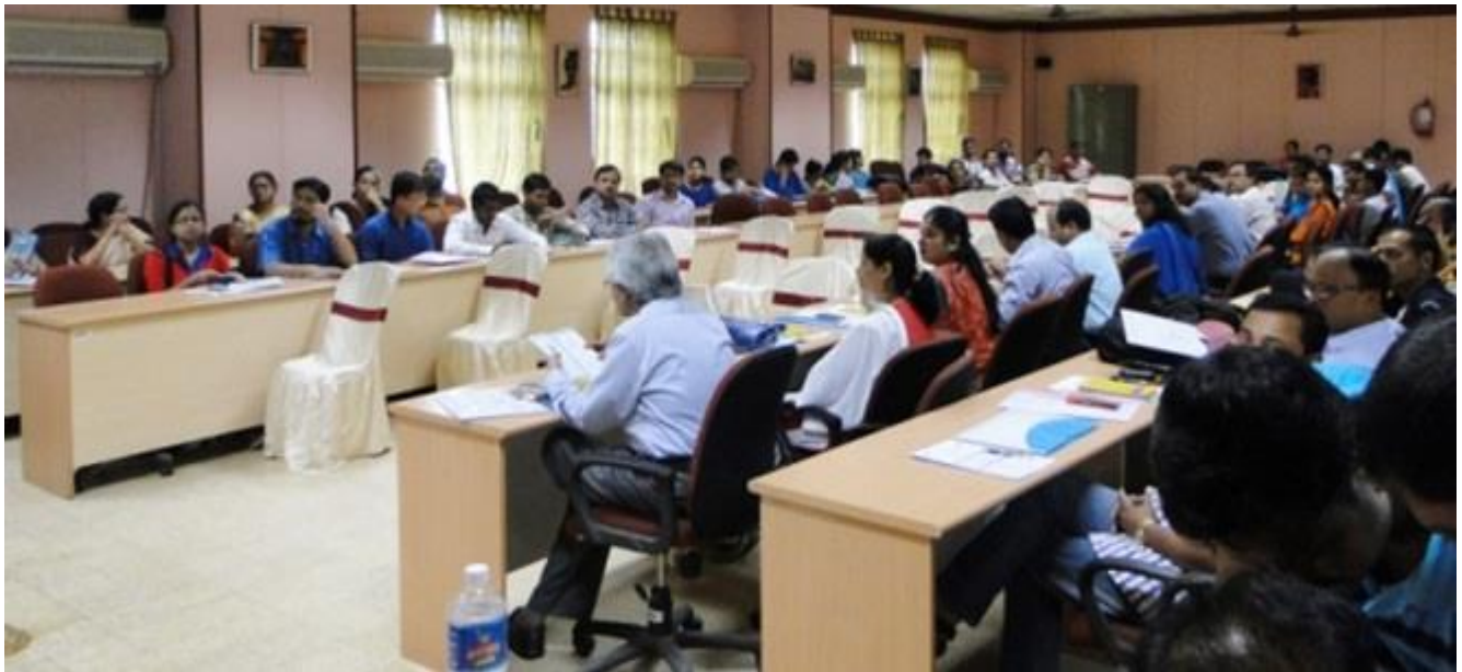
Audience at the Vice- Chancellor's address during the inauguration of the Two-Day Awareness Programme