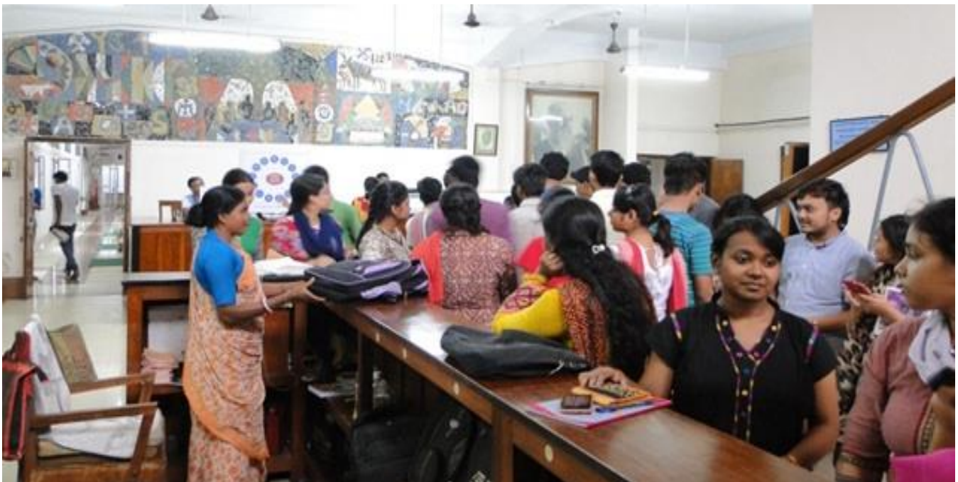
Registration of New Entrants at Central Library