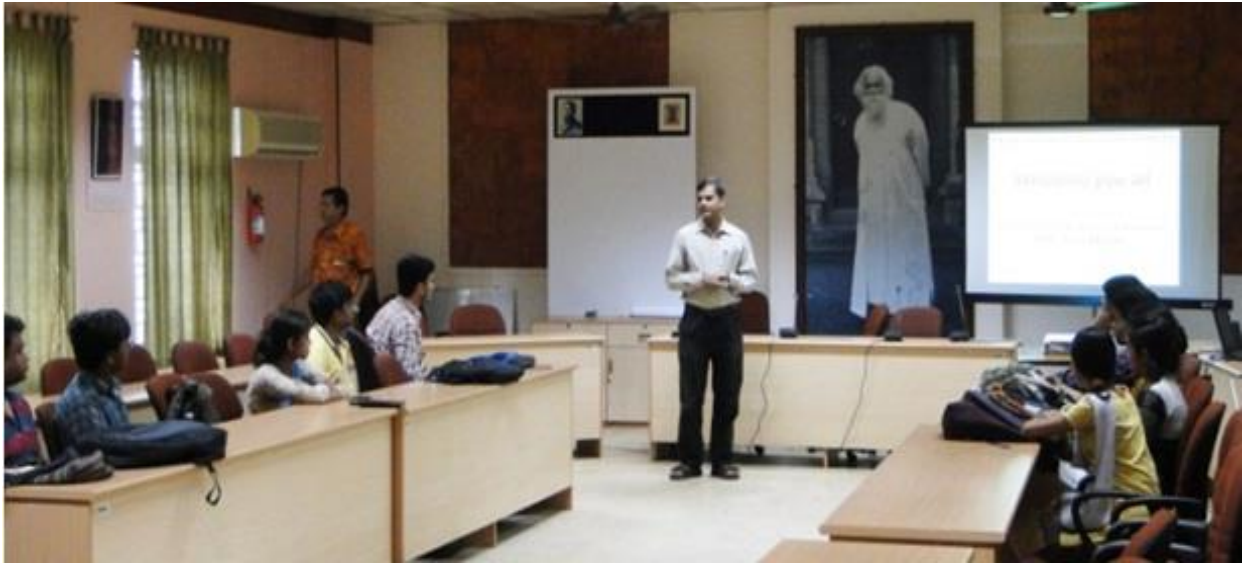
Orientation Programme for Freshers from Dept of Lifelong Learning and Extension, Central Library, 22 August