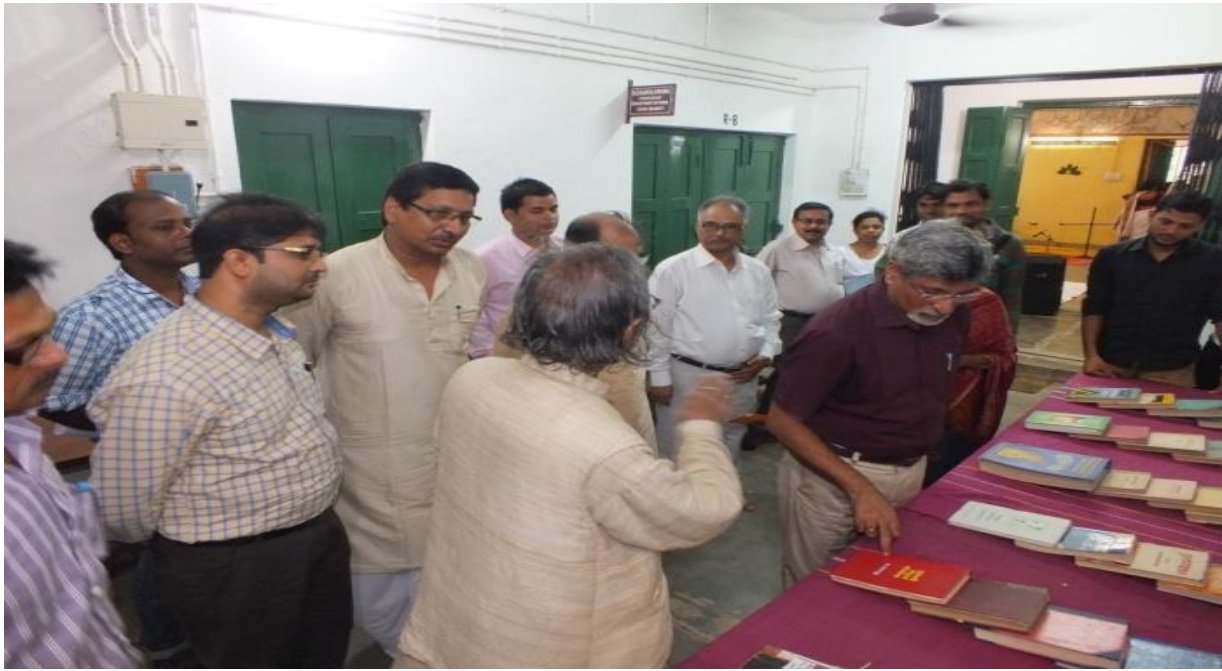
Book Exhibition on 'Tulsidas Sahitya', Hindi Bhavana Library on 22 August 2015