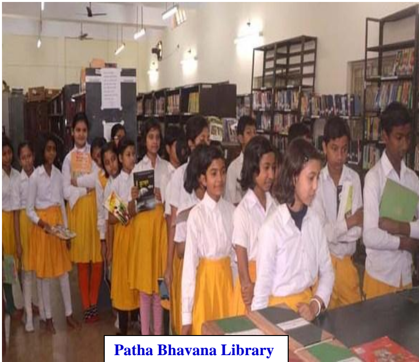
Patha Bhavana Library