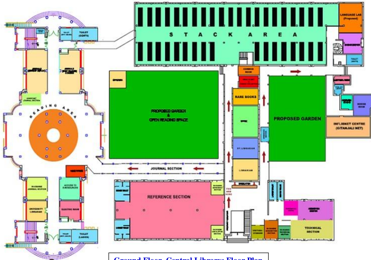
Ground Floor, Central Library: Floor Plan