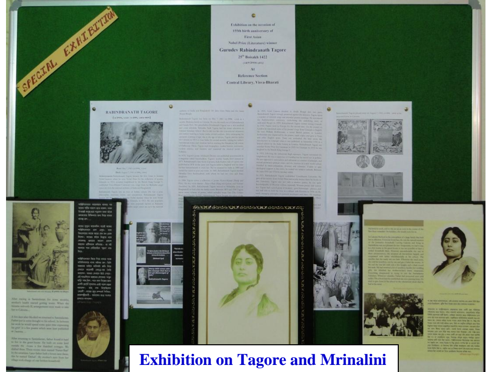
Exhibition on Tagore and Mrinalini