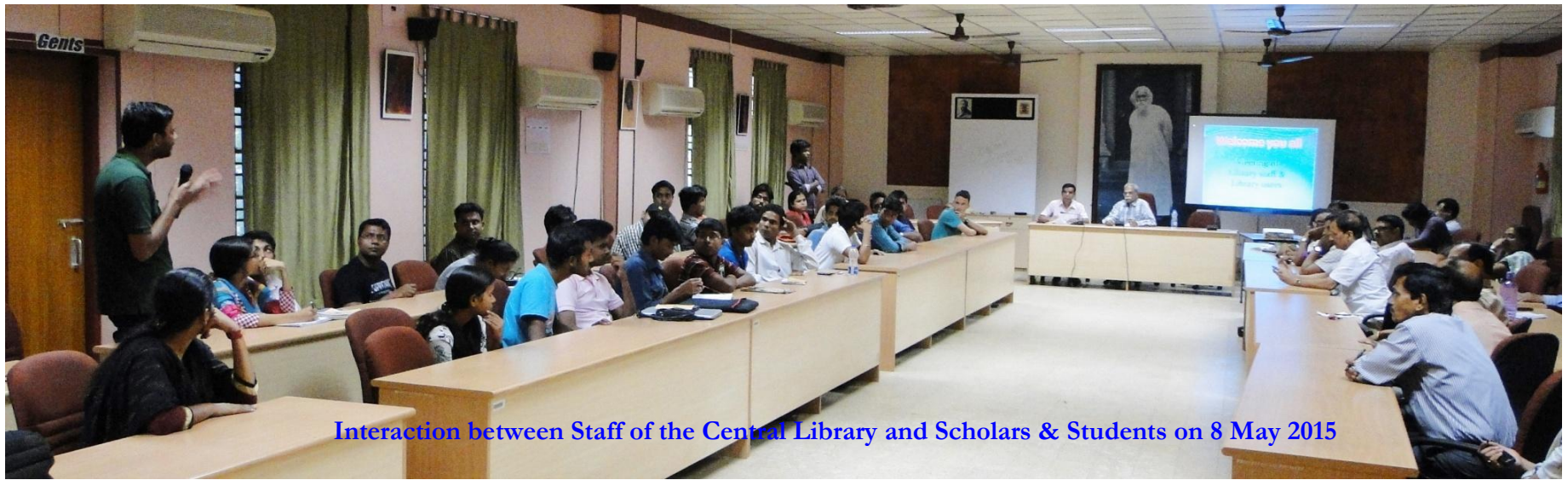
Interaction between Staff of the Central Library and Scholars & Students on 8 May 2015