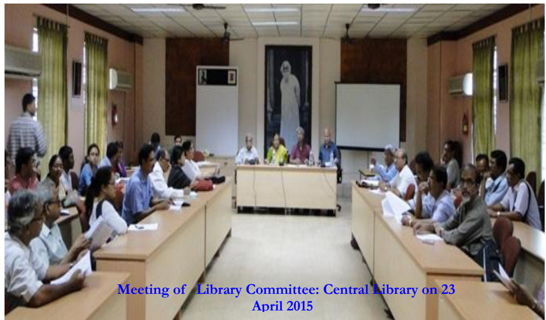
Meeting of Library Committee: Central Library on 23 April 2015