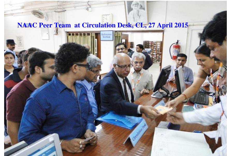
NAAC Peer Team at Circulation Desk, CL, 27 April 2015