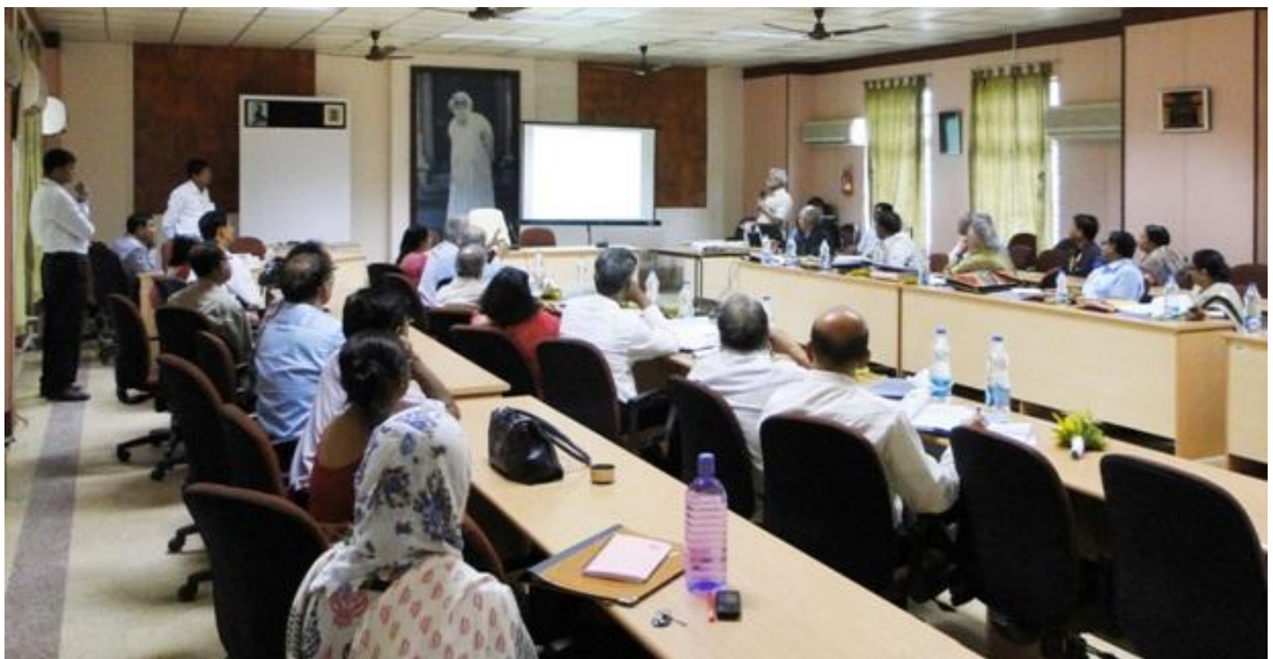
NAAC Peer Team Visit: PowerPoint Presentation, Central Library, 27 April 2015