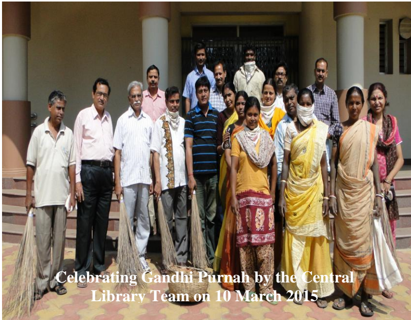
Celebrating Gandhi Purnah by the Central Library Team on 10 March 2015