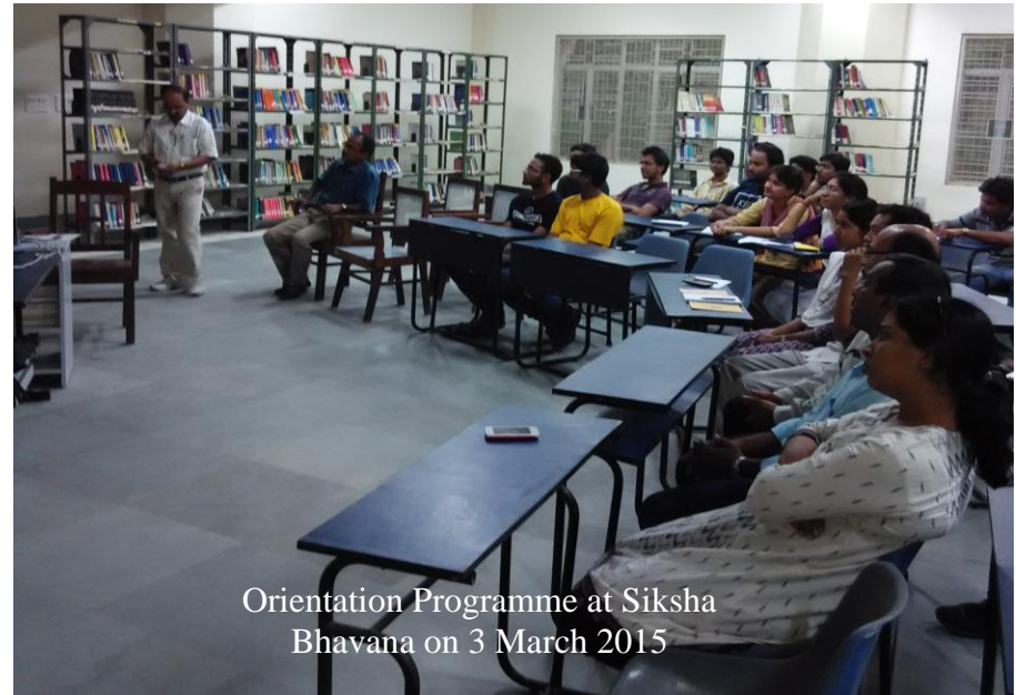
Orientation Programme at Siksha Bhavana on 3 March 2015