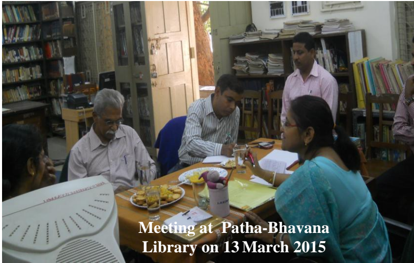
Meeting at Patha-Bhavana Library on 13 March 2015