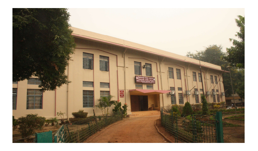
Visva-Bharati Central Library Building after renovation