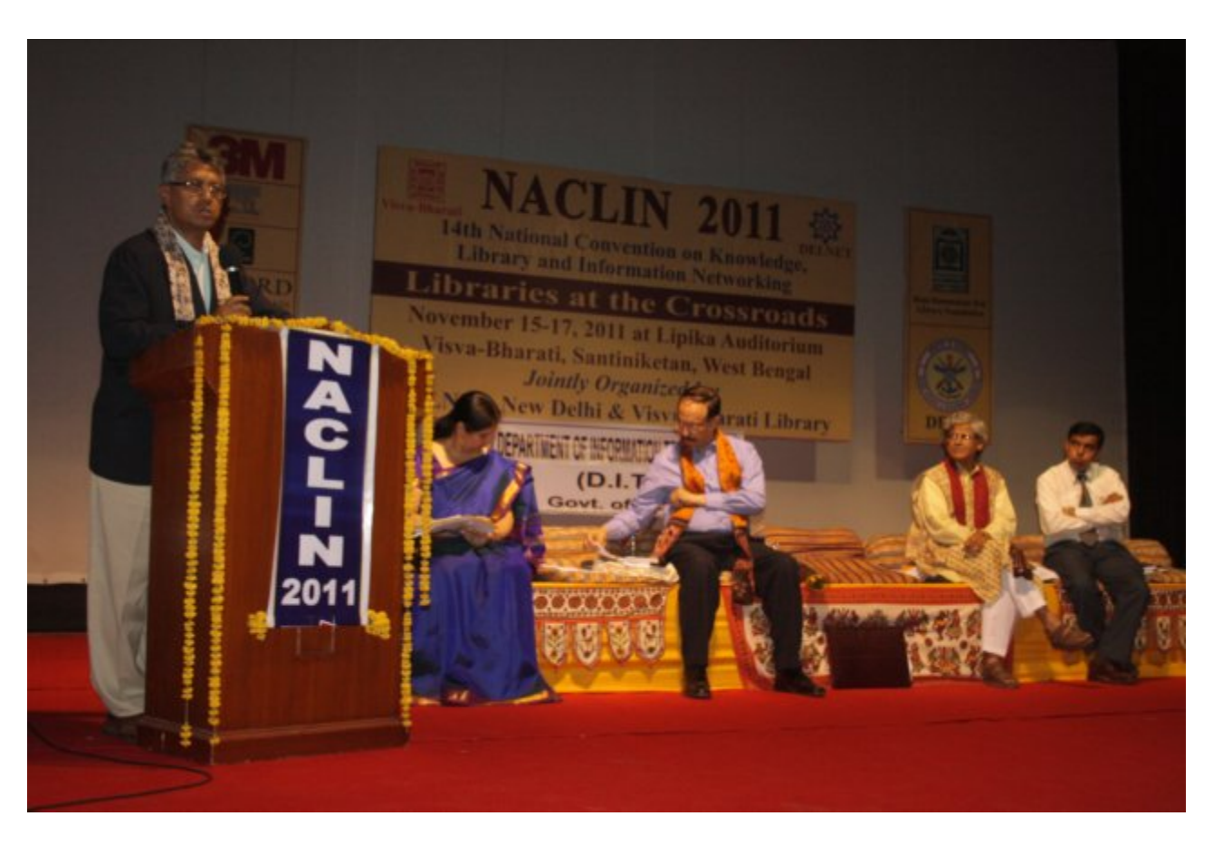
Upacharya, Visva-Bharati Addressing NACLIN 2011 Validation Ceremony