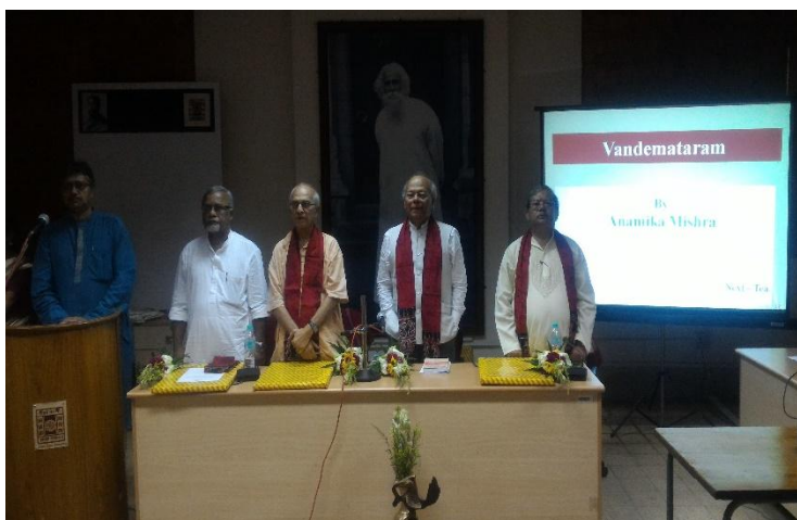
Closing Song during celebration of 125 th year of Chicago Speech of Swami Vivekananda on 20 September.