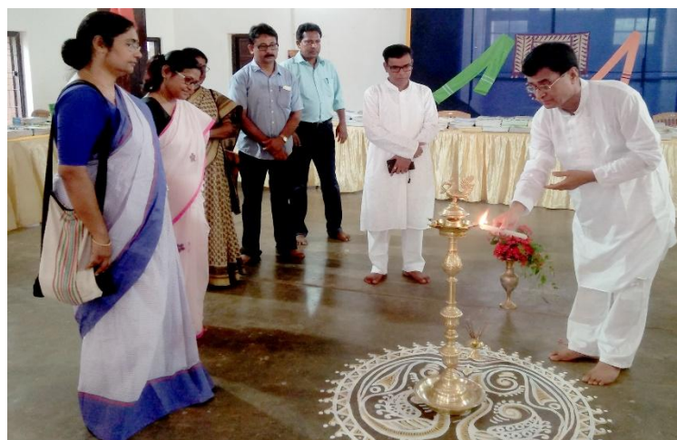
Inauguration of Book Fair – 2017, at Singha Sadana, Patha Bhavana on 08 September.