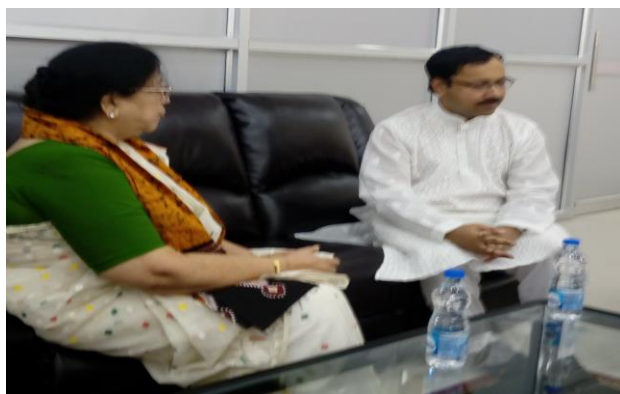
Hon'ble Vice Chancellor VB and Bangladesh Deputy High Commissioner at BBL