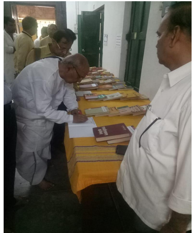
Book Exhibition on 'Tulsidas Sahitya' at Hindi Bhavana Library

Delegates along with faculties and students from Fu Jen Catholic University, Taipei, Taiwan have been visited the Cheena Bhavana Library on July 17, 2018