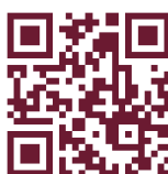
Online Databases (JSTOR, Indiatat, EPW, ISID, Artstor, JGate, ACS, IOP, Nature, CUP, AIP....)