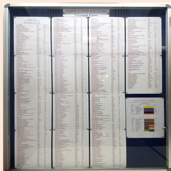
Figure-4: Subject Guide Panel

Colour Coding: Books are colour coded (subject-wise) on the spine for easy detection when misplaced. While great efforts are made to stack books back on racks immediately on return, one often comes across the painful cases of misplaced books, by accident or by intent. A misplaced book is deemed to be a book lost. To locate a misplaced book in a different floor or a stack 50 meters away or even on the same rack is quite a task in any library, let alone a large one like Central Library. (Remember never replace books in shelves but leave them on tables)