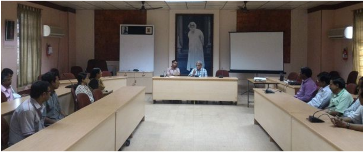
Gandhi Punnyah: Discussion on Significance of the Day & Various Shades of Cleanliness