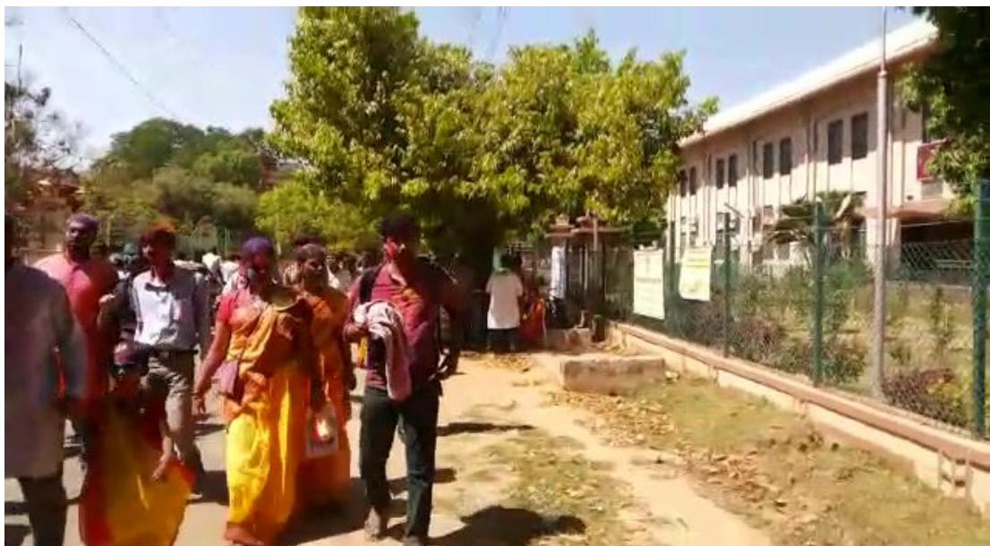
Vasantotsav revelers passing by Central Library: 23. 3. 2016