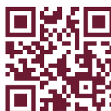
List of Bound Volume Journals