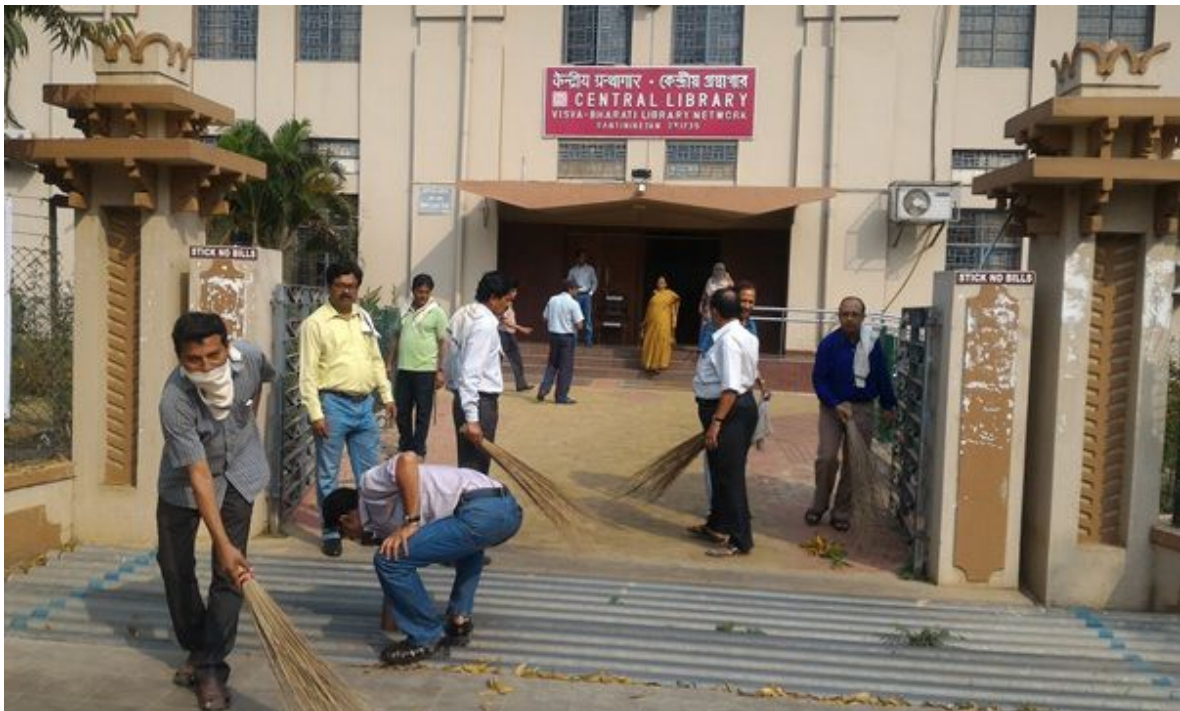
Gandhi Punnyah, 10 March 2016: Central Library Staff engaged in the Cleaning of the Premise