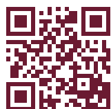
Resources and Services (With Links)