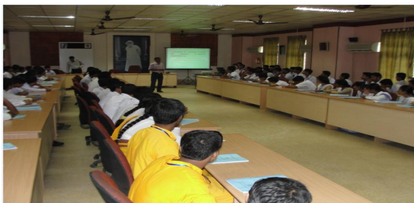
Library Orientation: DST INSPIRE