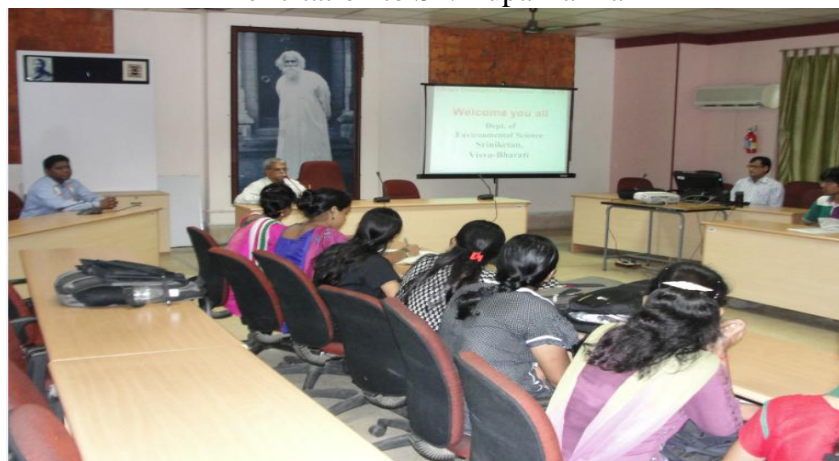
Library Orientation Programme