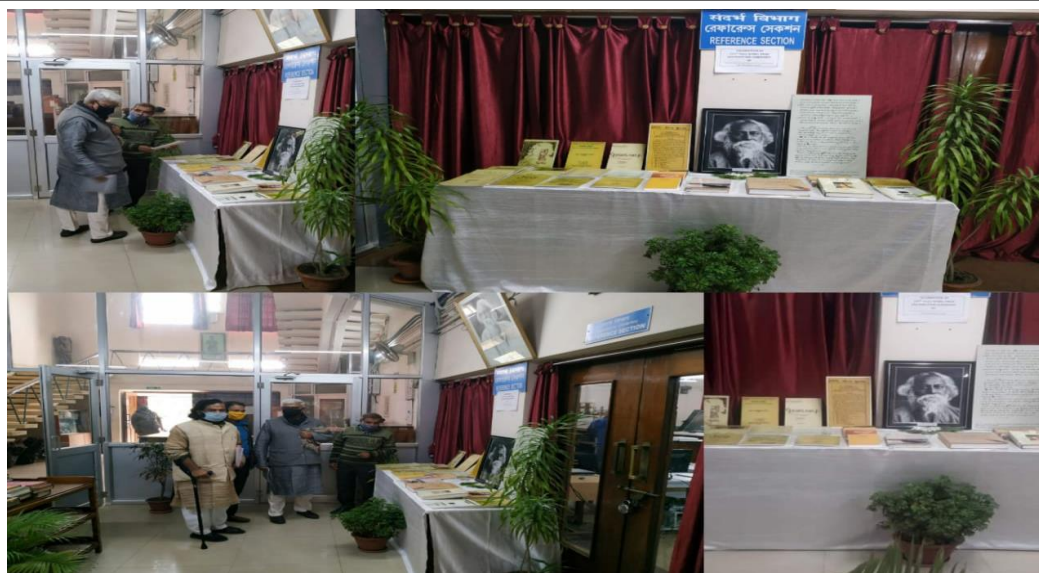
Hon'ble Vice Chancellor is visiting the Book Display