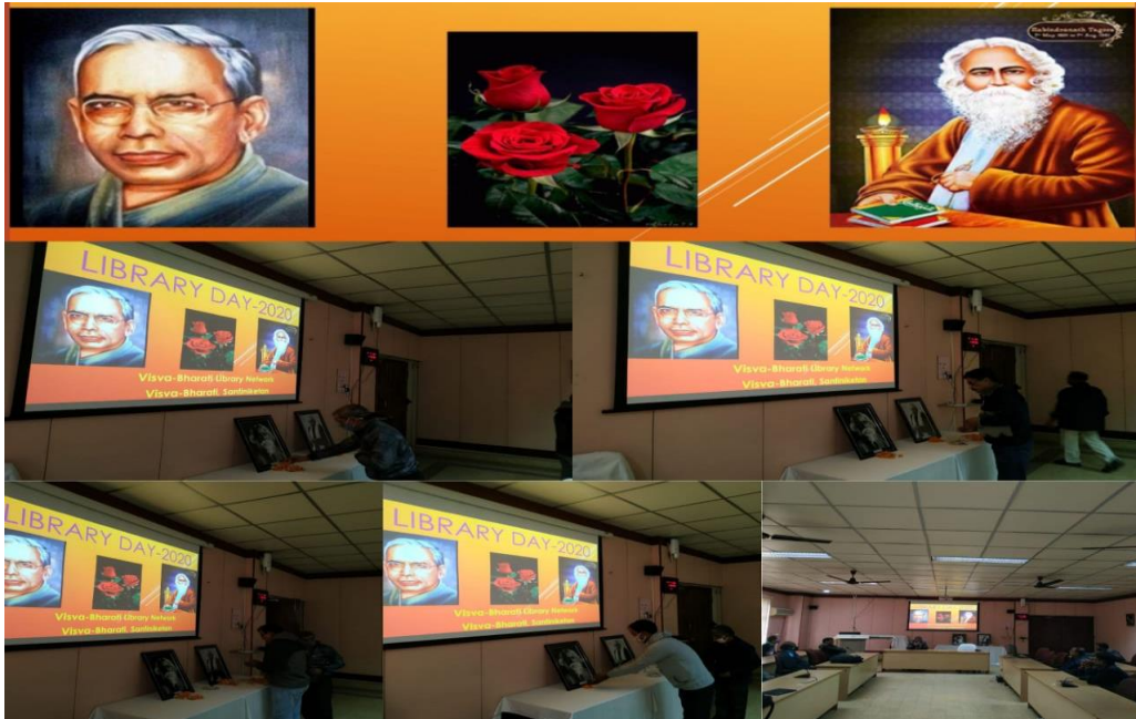
Glimpses of Librarians Day-2020