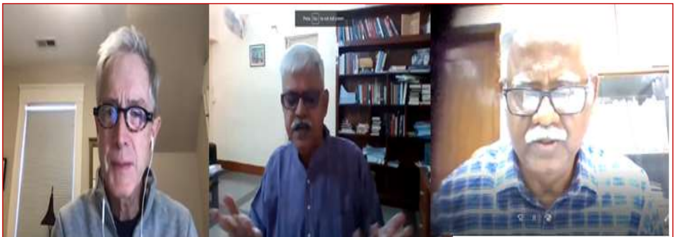
Speakers in 24 th and 25 th lecture on 18 th and 23 rd Nov in VB Lecture Series and Hon'ble Upacharyay, VB