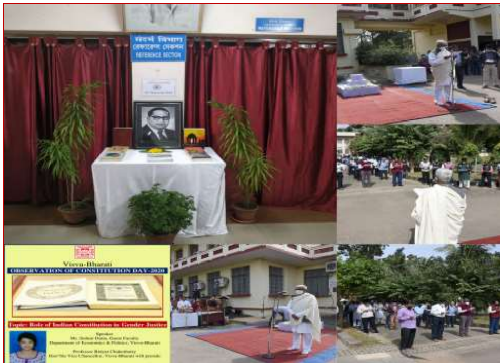
Constituion Day- 26 November 2020