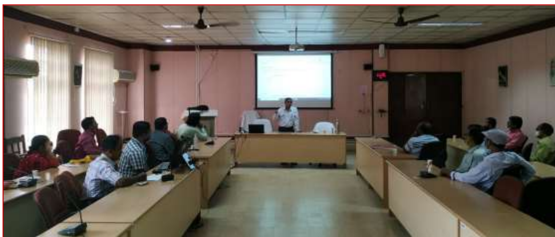
Special Session on URKUND (Similarity checking software) for the staff of the VBLN