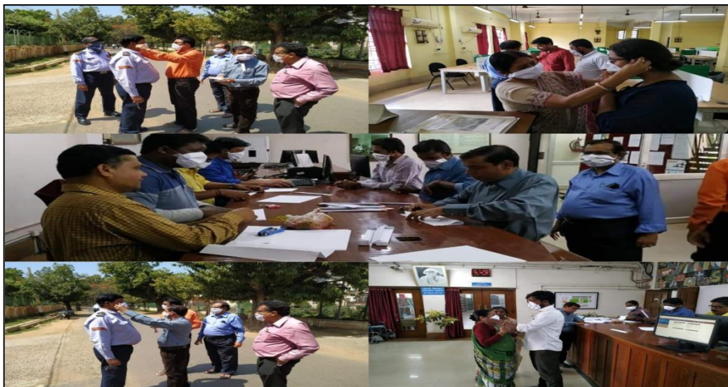
Preparation and Distribution of Paper Masks to fight against the pandemic Covid-19