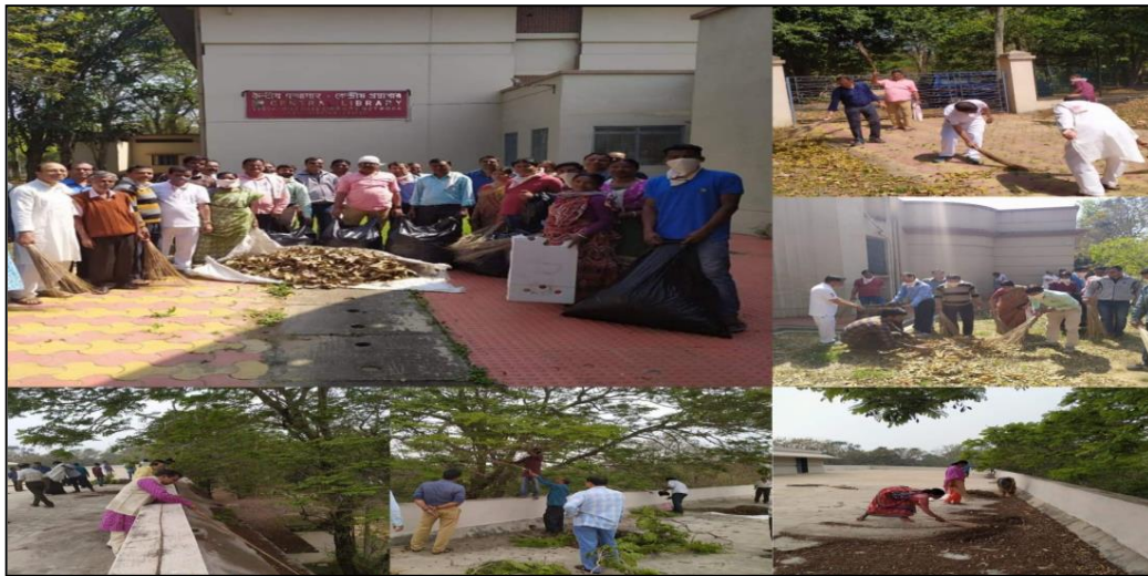
Week-long (10-16 March) cleaning drive on the occasion of Gandhi Punyaha