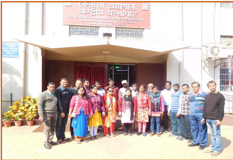
Braille students assembled after the special meeting on 25 January