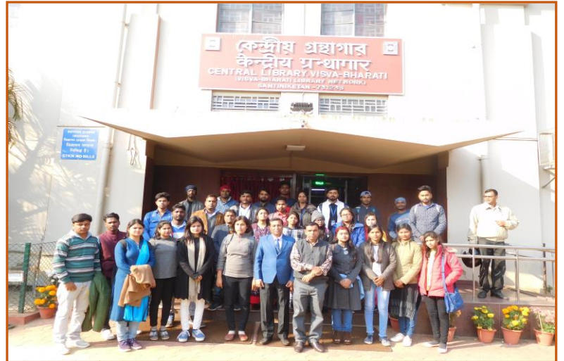
Group of Students and Teachers from Sidho Kanhu Murmu University, Dumka on 13 January